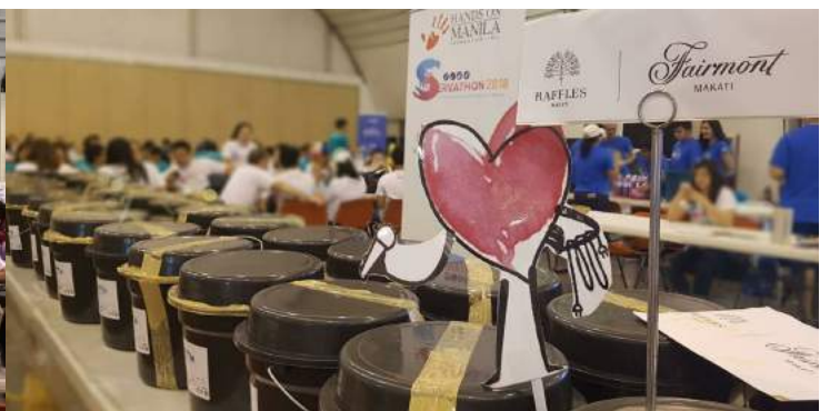
Raffles & Fairmont Makati Heartists preparing donation kits.