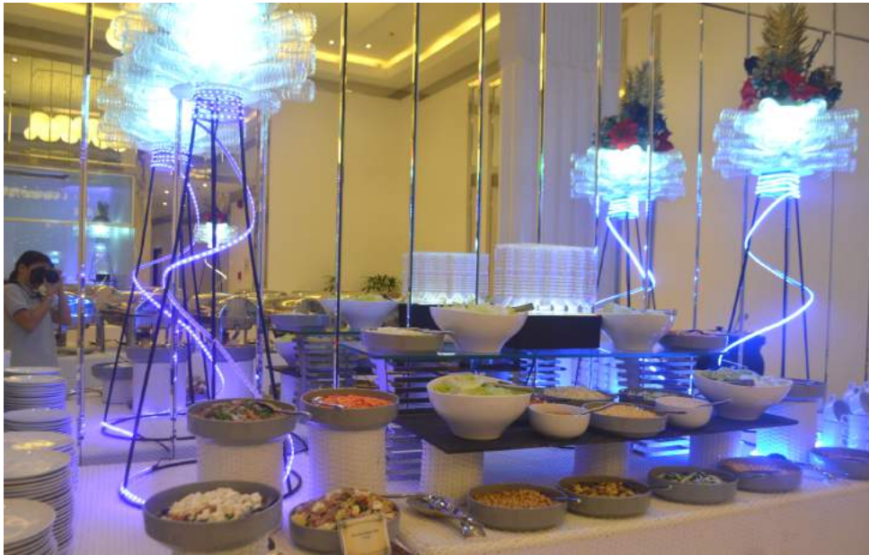
Plastic bottle accent light features that are displayed next to buffet tables during special events.