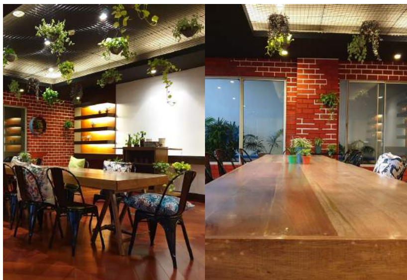
Joy-Nostalg Manila's rooftop private room themed around plant life & greenhouses.