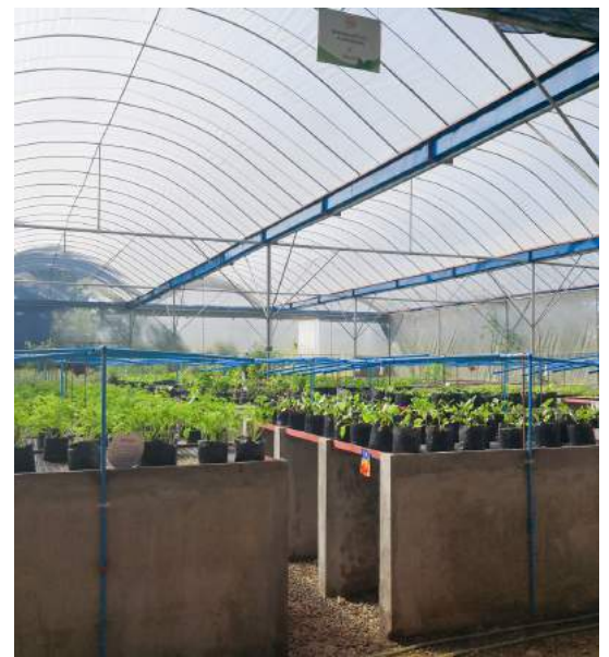
Novotel's Healthy N Sustainable Garden.

The hotel's kitchen advocates ensure offerings are made of healthy, balanced and high-quality food to include products sourced from the organic farm, so guests can 'Eat Fresh N Eat Right' at Novotel Manila Araneta Center.