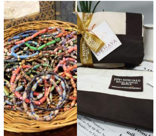
Likhaya by Virланie's bags and crafts.

In collaboration with Likhaya by Virланie during the Christmas season, Joy~Nostalg Manila promoted crafts made by the organization's mother artisans from partner indigent communities. Crafts include their handmade bracelets, charms and gift items. The hotel also commissioned Virланie's services to create tote bags and pouches as giveaways to guests, partners and clients to further support local and sustainable community business.