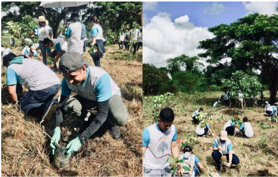
Heartists planting alongside each other in Sta. Rosa, Laguna.