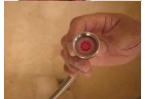
Water flow regulators installed in-room.