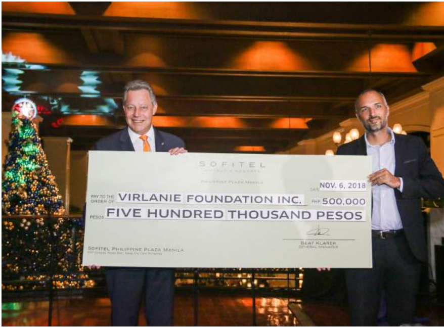
Check handover during Sofitel Manila's 2018 Tree Lighting Ceremony.