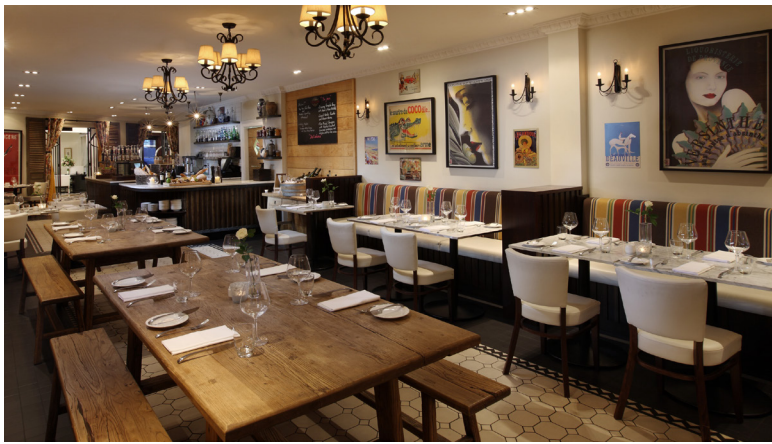
Left Bank Café