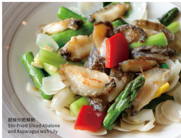
碧綠炒脆鮮鮑 Stir-Fried Sliced Abalone and Asparagus with Lily