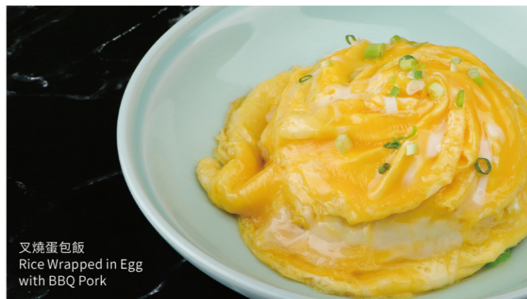
叉燒蛋包飯 Rice Wrapped in Egg with BBQ Pork