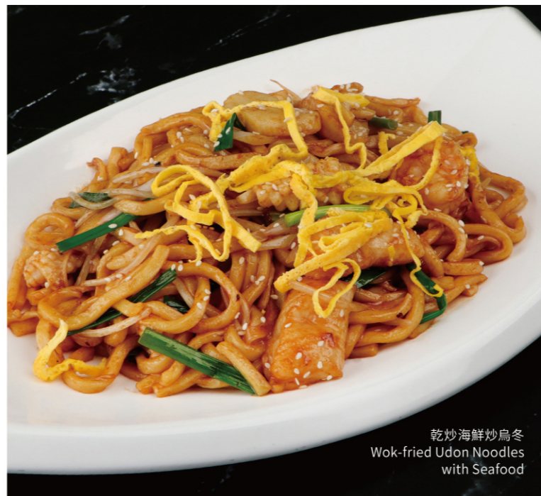
乾炒海鮮烏冬 Wok-fried Udon Noodles with Seafood