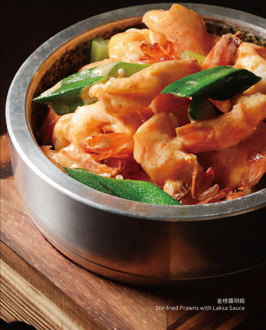
金榜醬明蝦 Stir-fried Prawns with Laksa Sauce

· 扫描左侧二维码，进入尊享心世界，注册成为会员。 · 获赠尊贵专享的会员卡，即可获得奖励积分。 · 1欧元 (约8元) 消费=奖励积分。 · 积分可当“现金”用来抵扣房费。