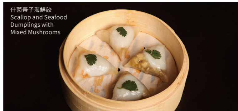
什菌帶子海鮮餃 Scallop and Seafood Dumplings with Mixed Mushrooms