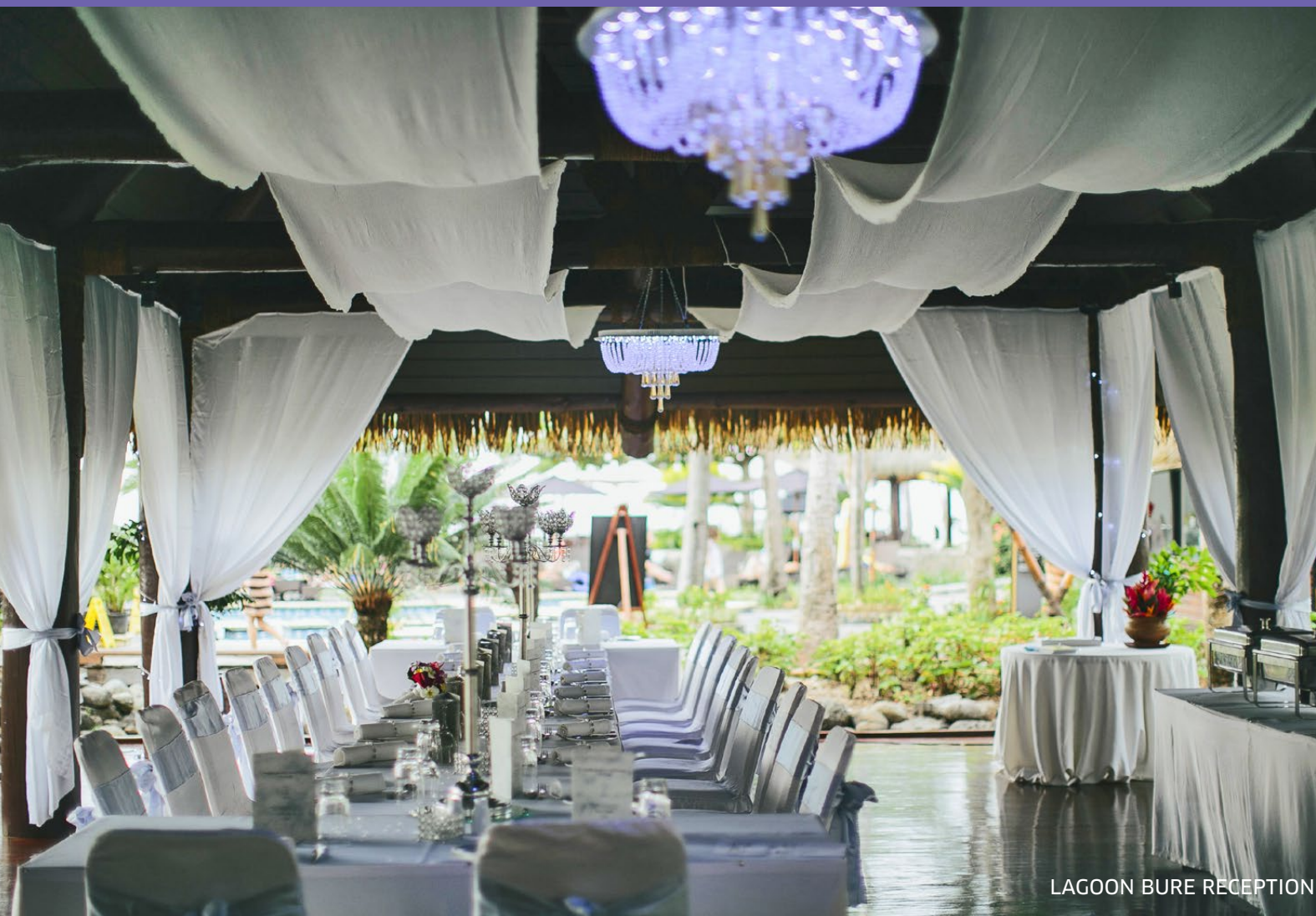
LAGOON BURE RECEPTION

— THERE ARE WEDDINGS, THEN THERE ARE MEMORIES FOR A LIFETIME. —