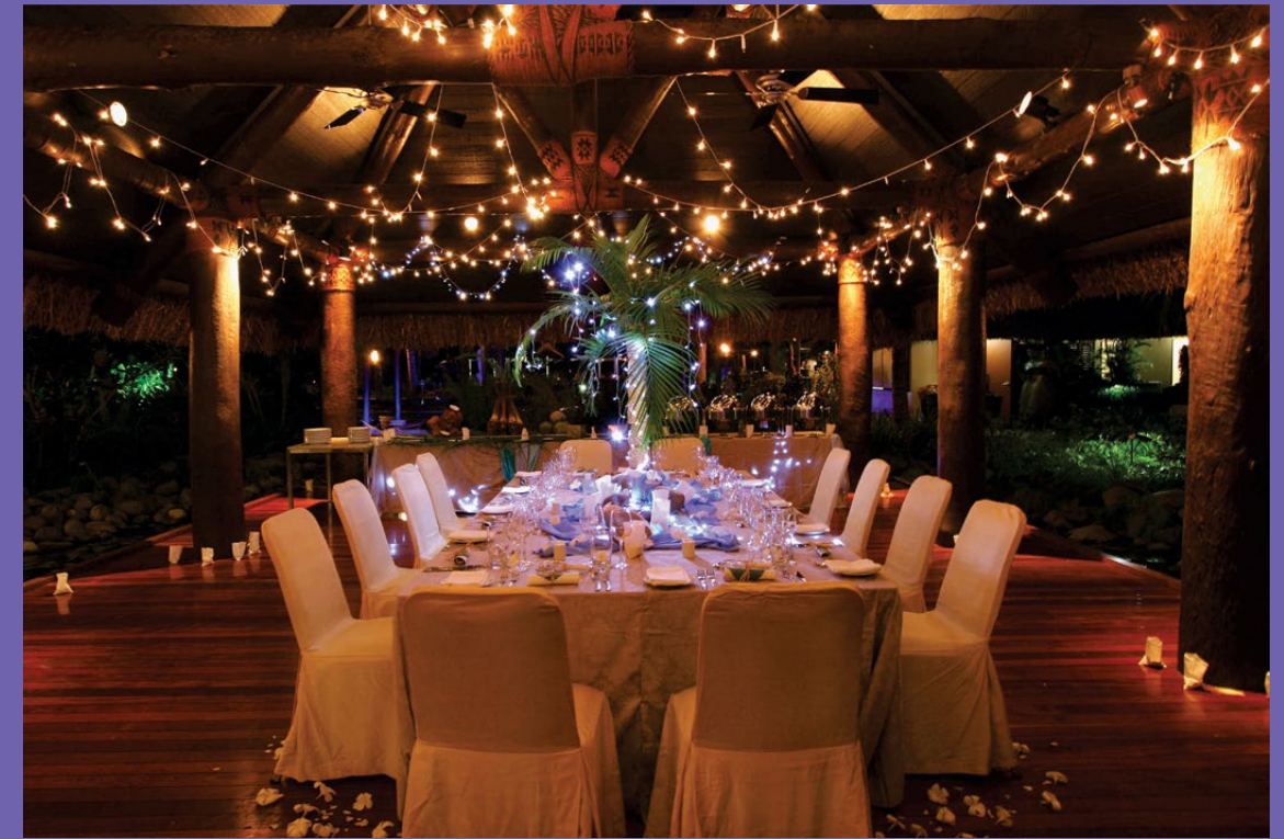
Above: Lagoon Bure. Minimum of 10 guests.