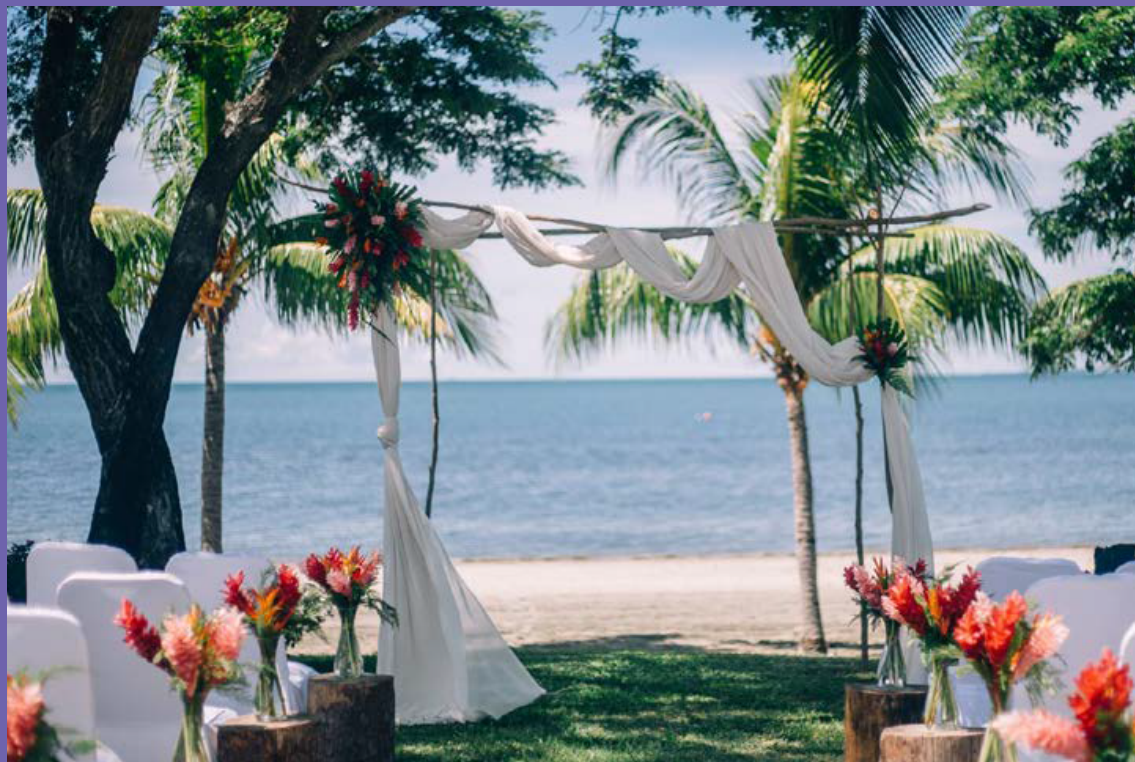
Above: North West Lawn. Minimum of 10 guests and a maximum of 100 guests.