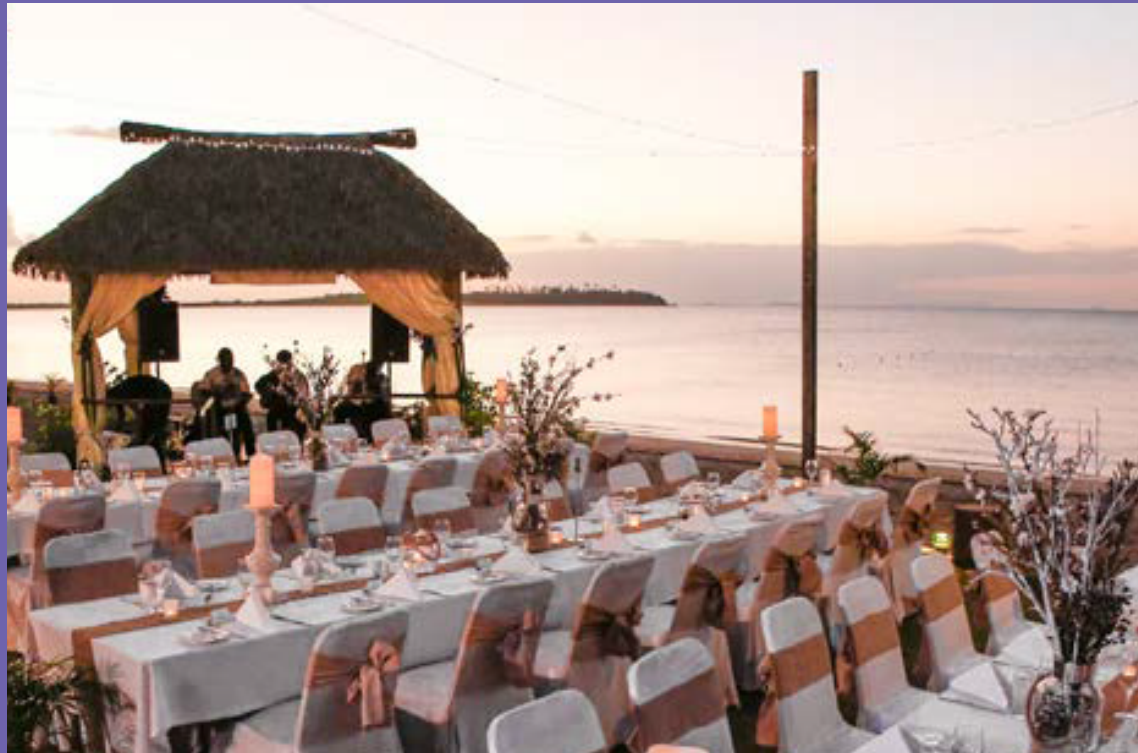
Above: Sofitel Beachfront. FJ$840. Minimum of 10 guests and a maximum of 350 guests.