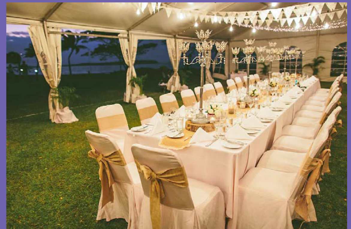
Above: Meke Lawn. Minimum of 10 guests and a maximum of 350 guests.