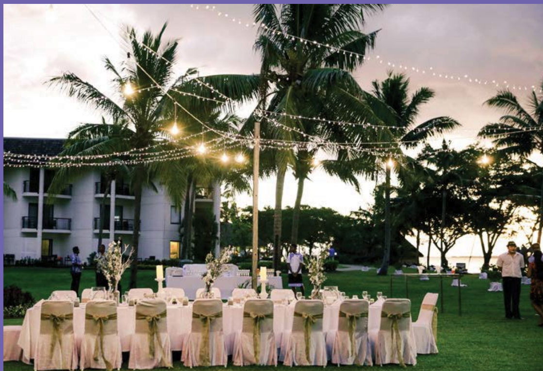
Above: North West Lawn. Minimum of 10 guests and a maximum of 50 guests. Venue hire $840.