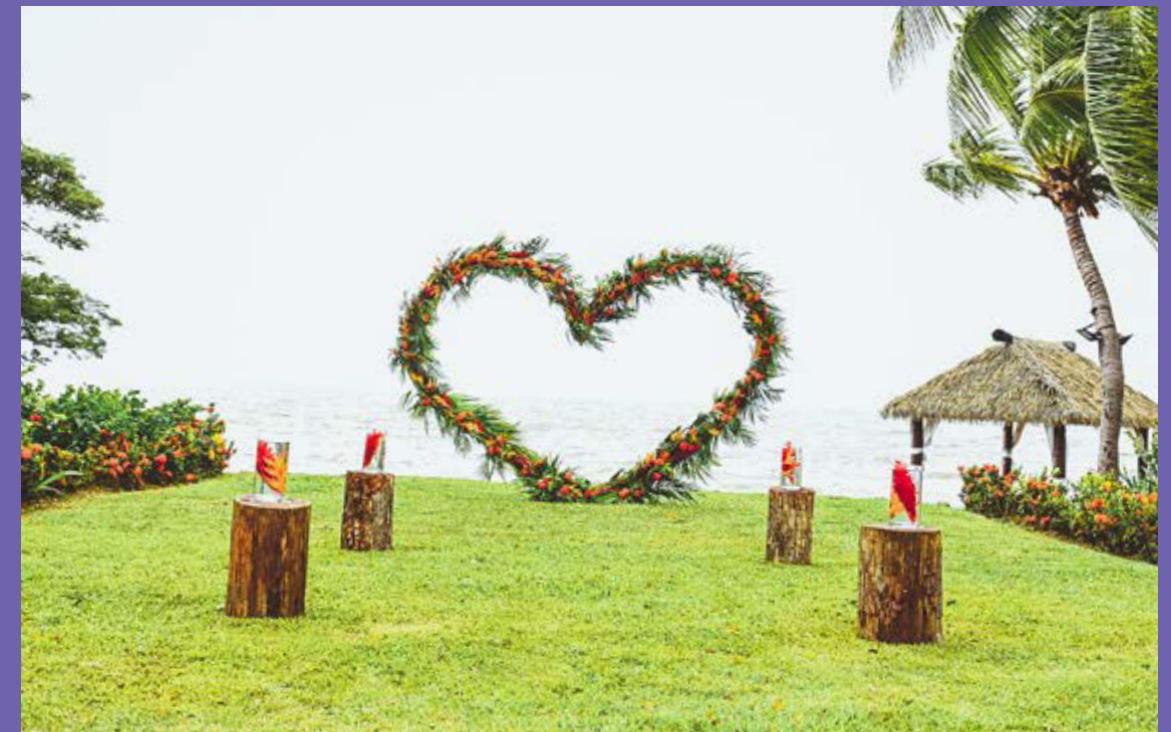
Above: SO SPA Courtyard. Minimum of 10 guests and a maximum of 60 guests.