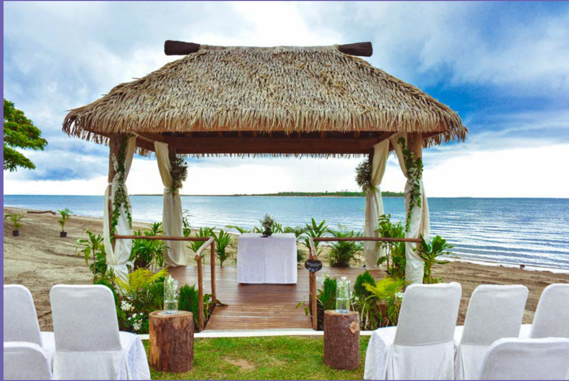
Above: Beachfront Bure. Minimum of 10 guests and a maximum of 70 guests.