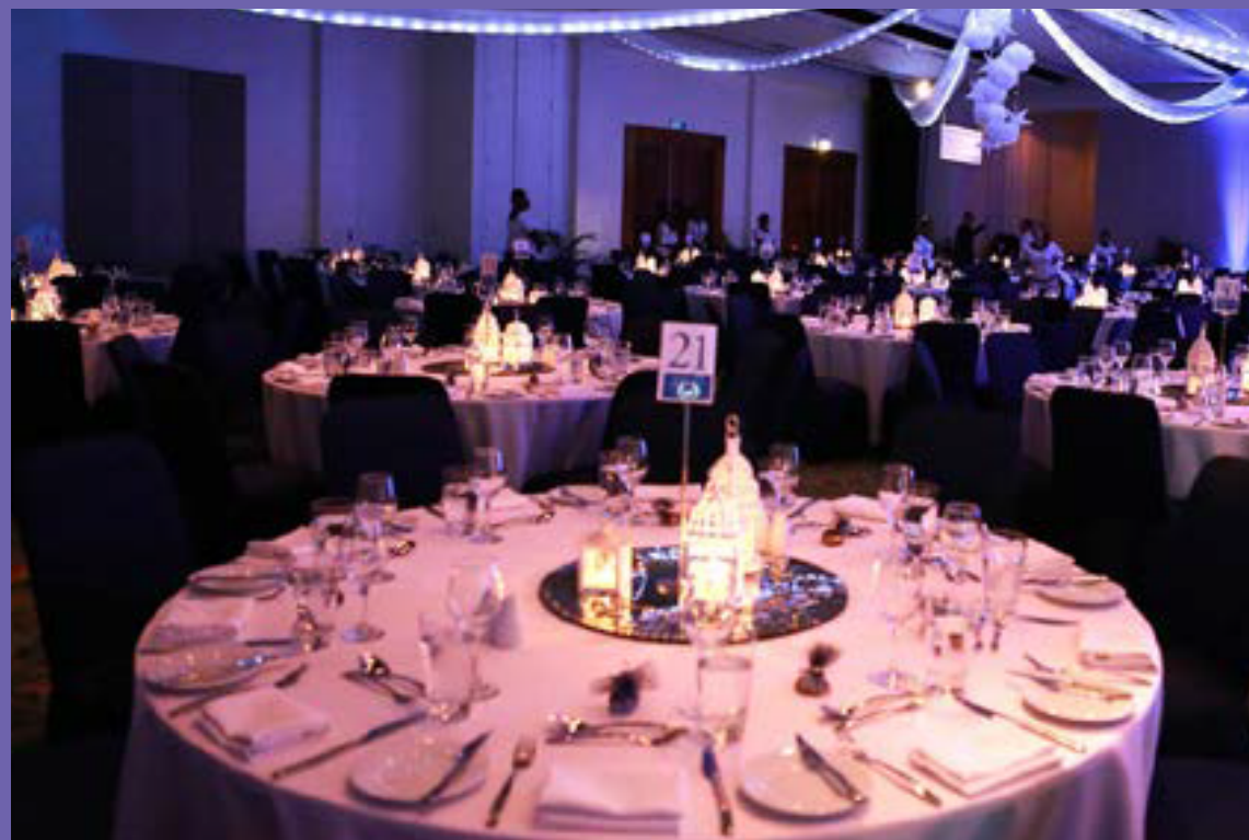
Above: Grand Ballroom. FJ$840. Minimum of 10 guests and a maximum of 640 guests.