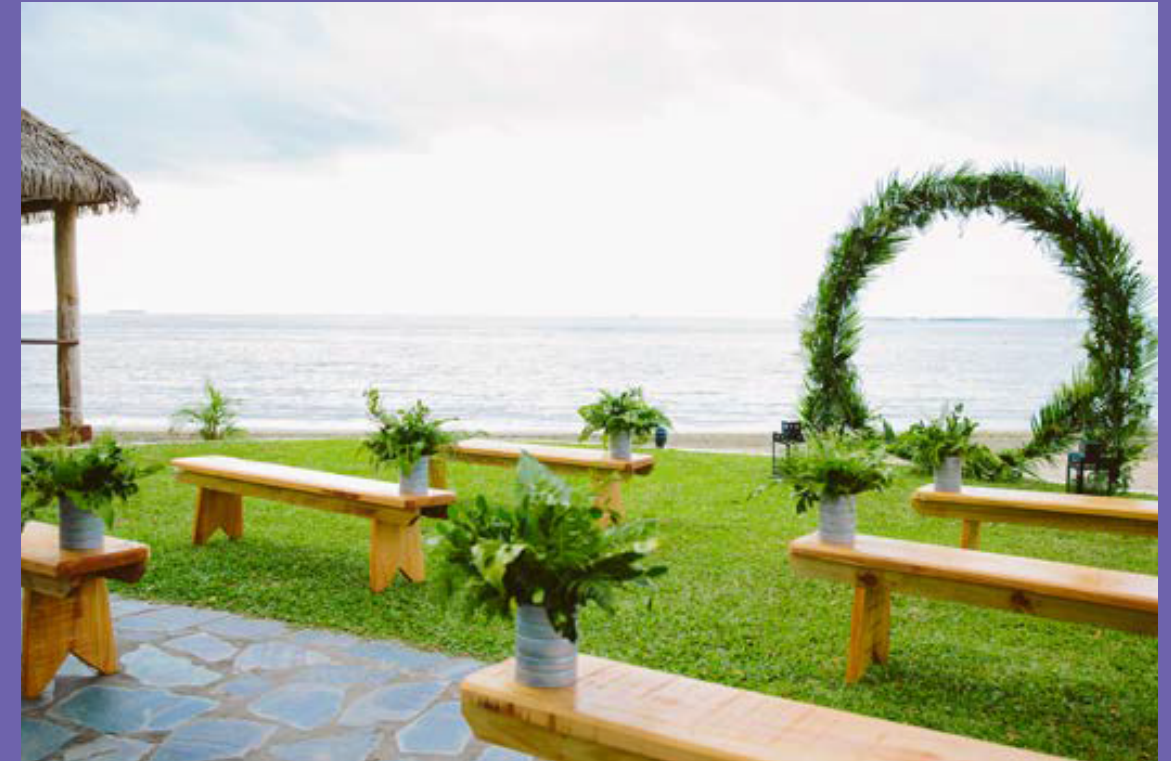
Above: Sofitel Beachfront. Minimum of 10 guests and a maximum of 100 guests.