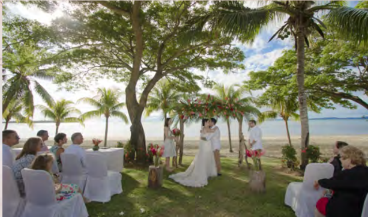
North West Lawn

Minimum 10 guests &amp; maximum 100 guests