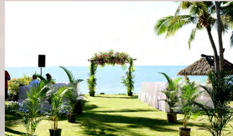
Spa Lawn - Venue Hire Fee Applies

Minimum 10 guests &amp; maximum 100 guests