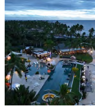
Waitui Beach Club