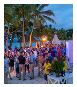
Waitui Lower Deck