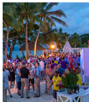
Waitui Lower Deck