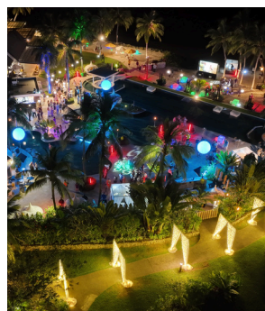
Waitui Beach Club