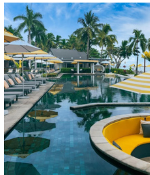
Waitui Beach Club