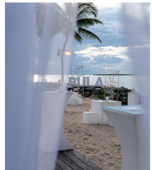
Waitui Lower Deck