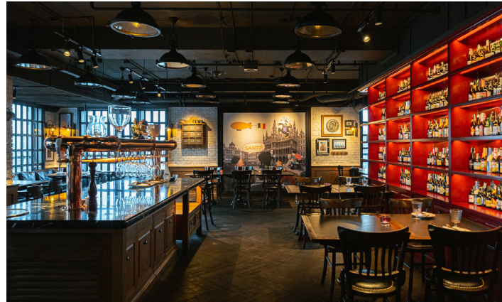
BELGA ROOFTOP BAR & BRASSERIE