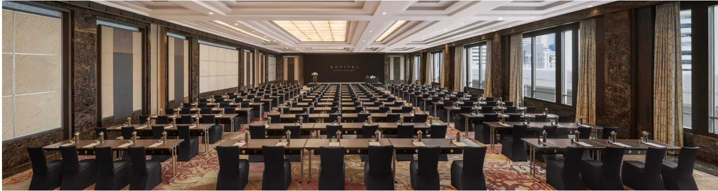
LE GRAND BALLROOM

With multi-functional meeting spaces equipped with all modern amenities, luxurious rooms and unparalleled service, your event is sure to be magnifique. Our dedicated event planners are committed to building completely successful and tailored meetings and events, with creative coffee breaks, personalized banqueting options and innovative technology solution.