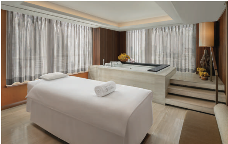
SOFITEL SPA WITH L'OCCITANE