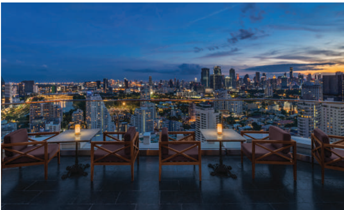
BELGA ROOFTOP BAR & BRASSERIE