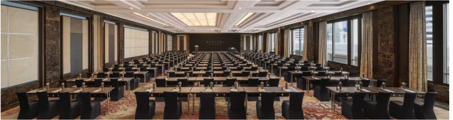
LE GRAND BALLROOM

With multi-functional meeting spaces equipped with all modern amenities, luxurious rooms and unparalleled service, your event is sure to be magnifique. Our dedicated event planners are committed to building completely successful and tailored meetings and events, with creative coffee breaks, personalized banqueting options and innovative technology solution.