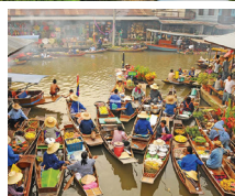
TALING CHAN FLOATING MARKET