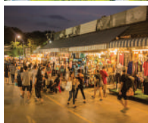
CHATUCHAK WEEKEND MARKET