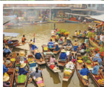
TALING CHAN FLOATING MARKET