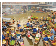
TALING CHAN FLOATING MARKET