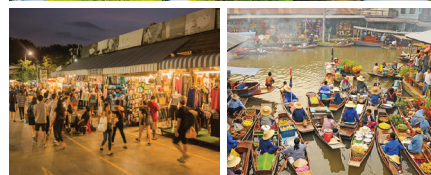
CHATUCHAK WEEKEND MARKET