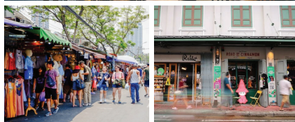
CHATUCHAK WEEKEND MARKET