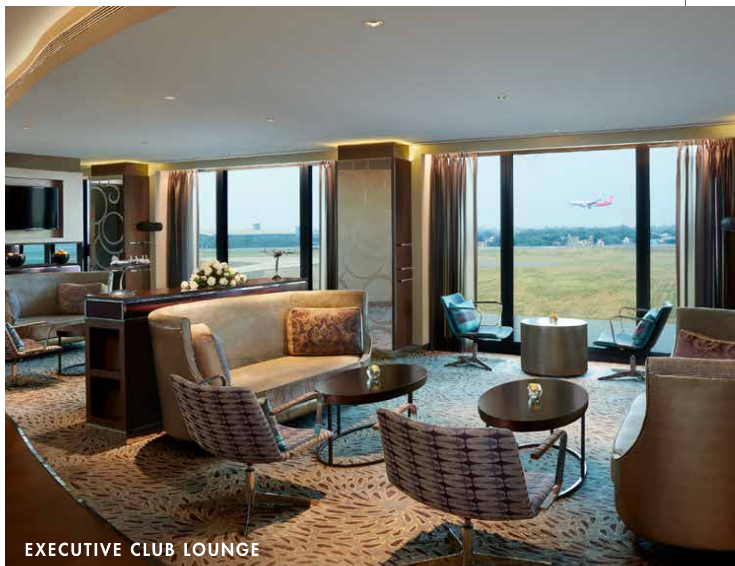
EXECUTIVE CLUB LOUNGE

Treat yourself to a luxury escape and let us pamper you!