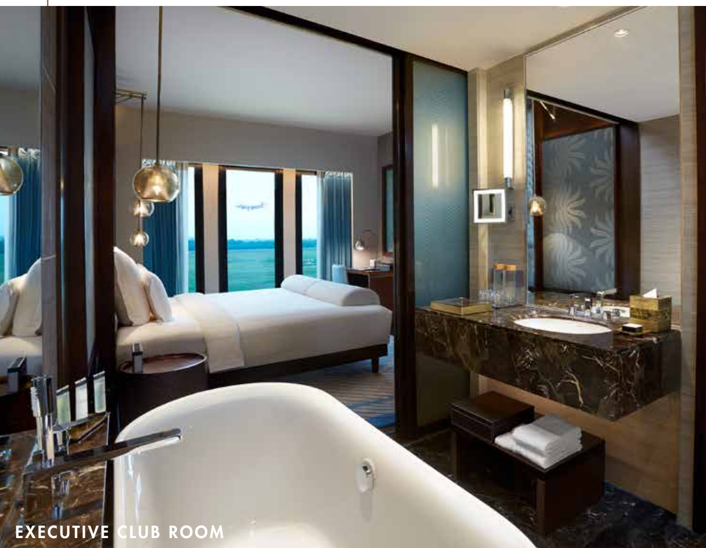
EXECUTIVE CLUB ROOM