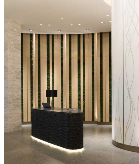
Individual Reception Desks