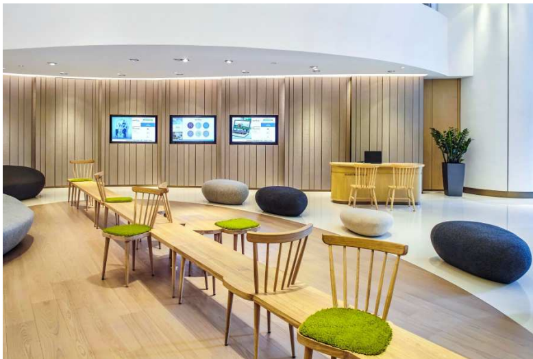
Central seating area