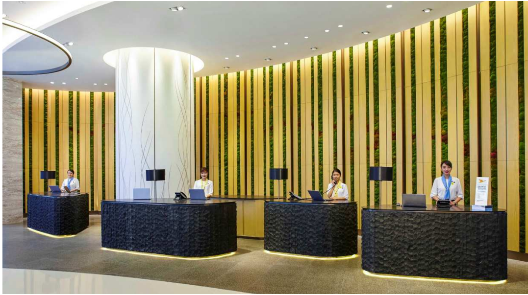
Reception Desks and Green wall