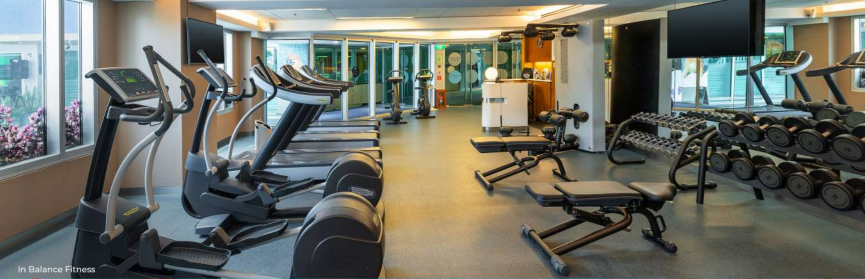
In Balance Fitness