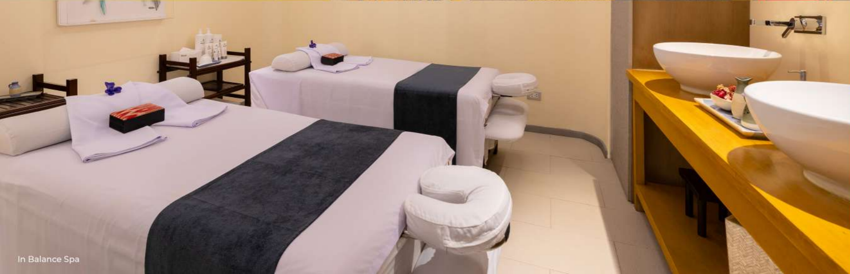
In Balance Spa