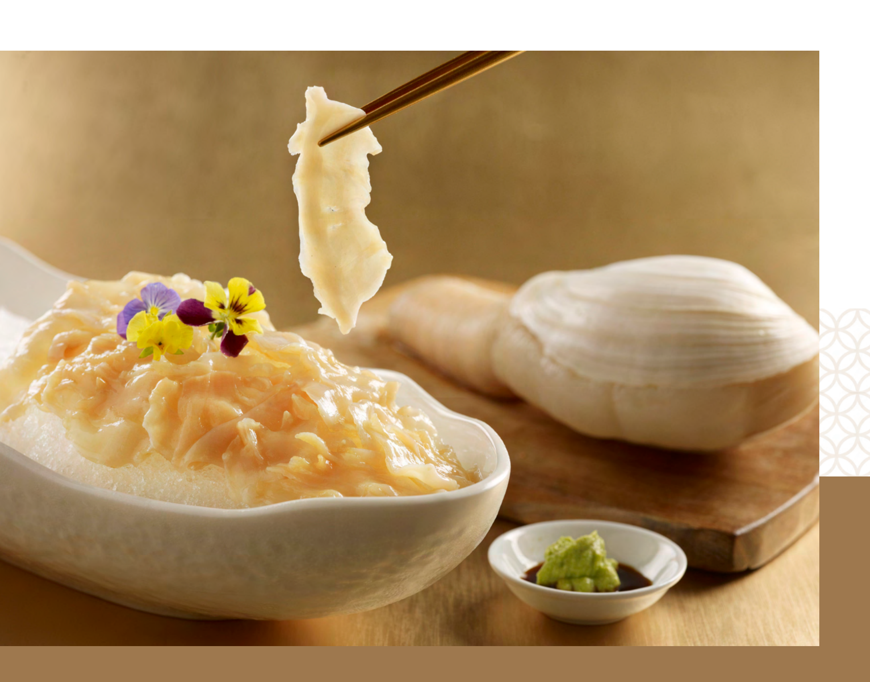
加拿大象拔蚌 Canadian Geoduck Clam