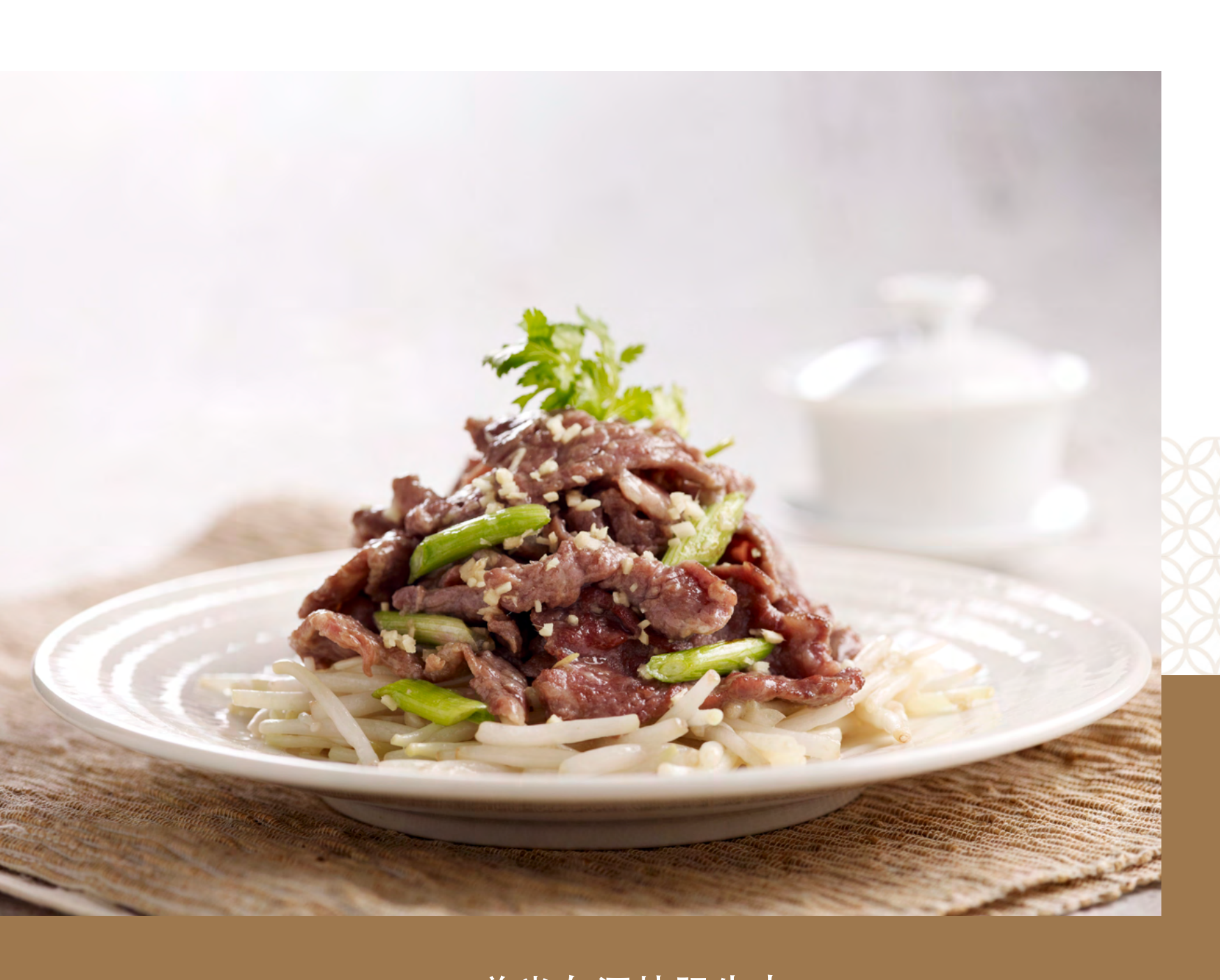
姜米白酒炒肥牛肉 Wok-fried Beef with Ginger and Chinese Rice Wine