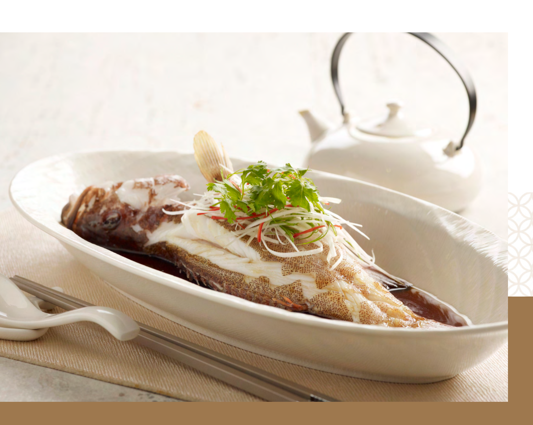
清蒸東星斑 Steamed Coral Trout with Superior Soya Sauce