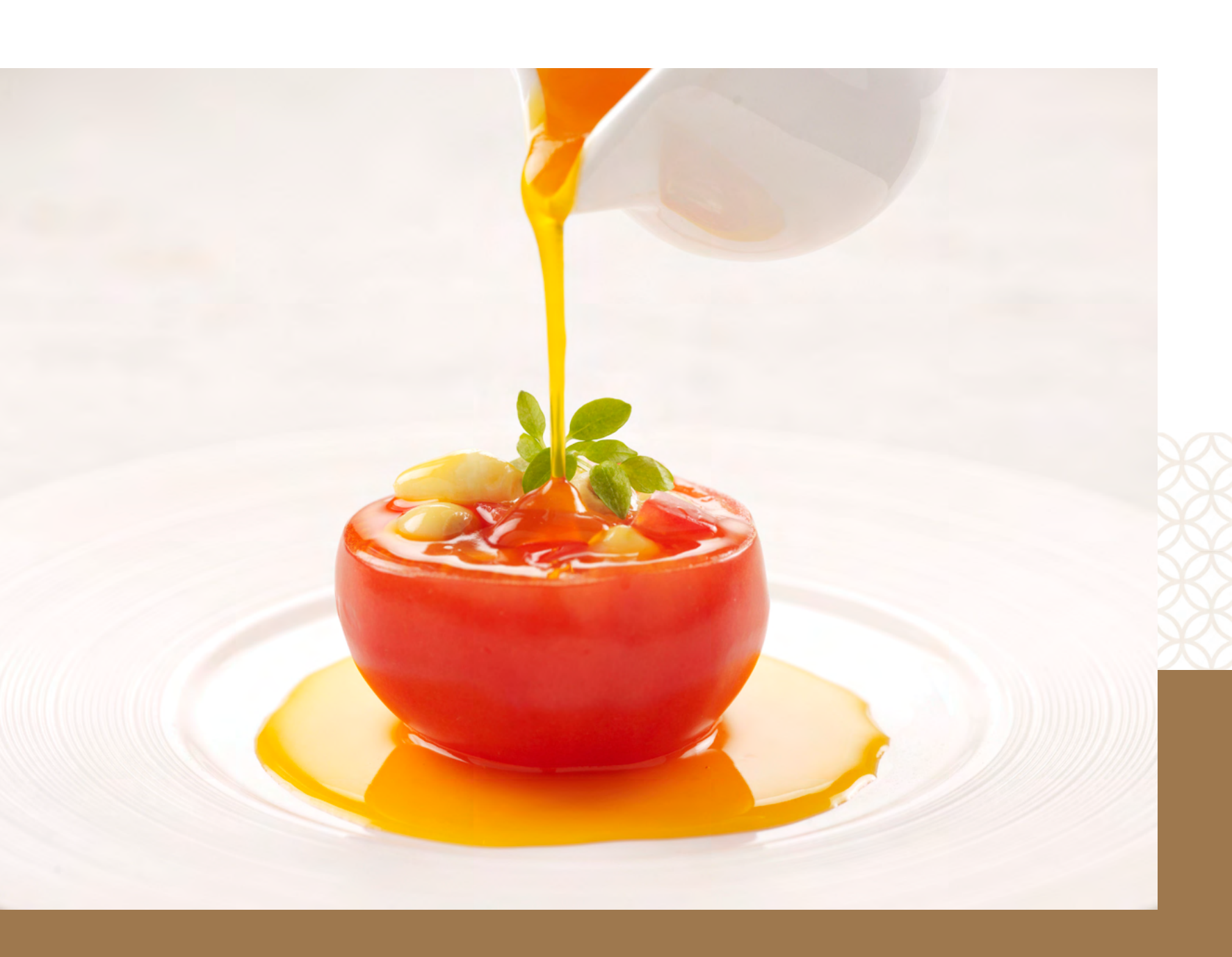
蓮子红柿 Steamed Tomato with Lotus Seed