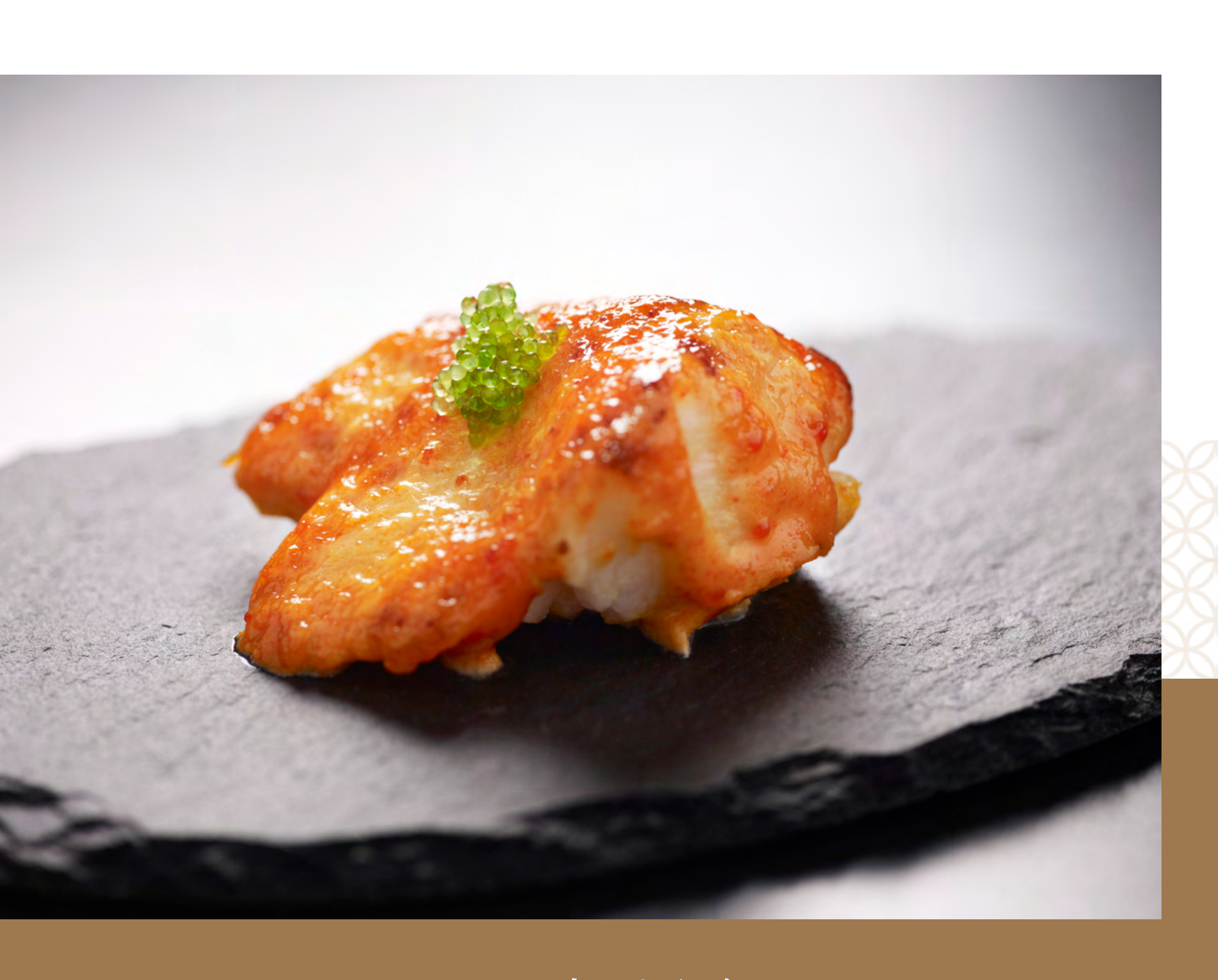
明太子焗鳕鱼 Mentaiko Cod Fillet