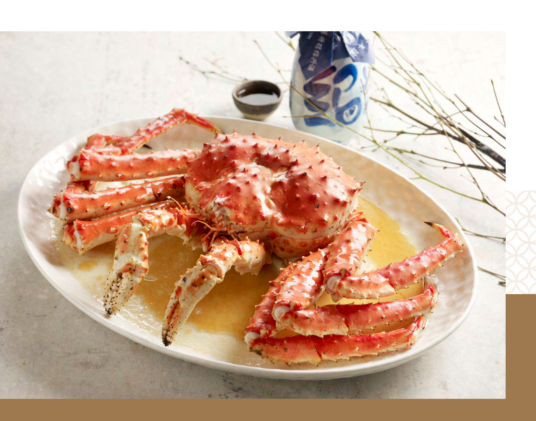
鸡油花雕蒸阿拉斯卡蟹 Alaskan King Crab Steamed with Chinese Rice Wine