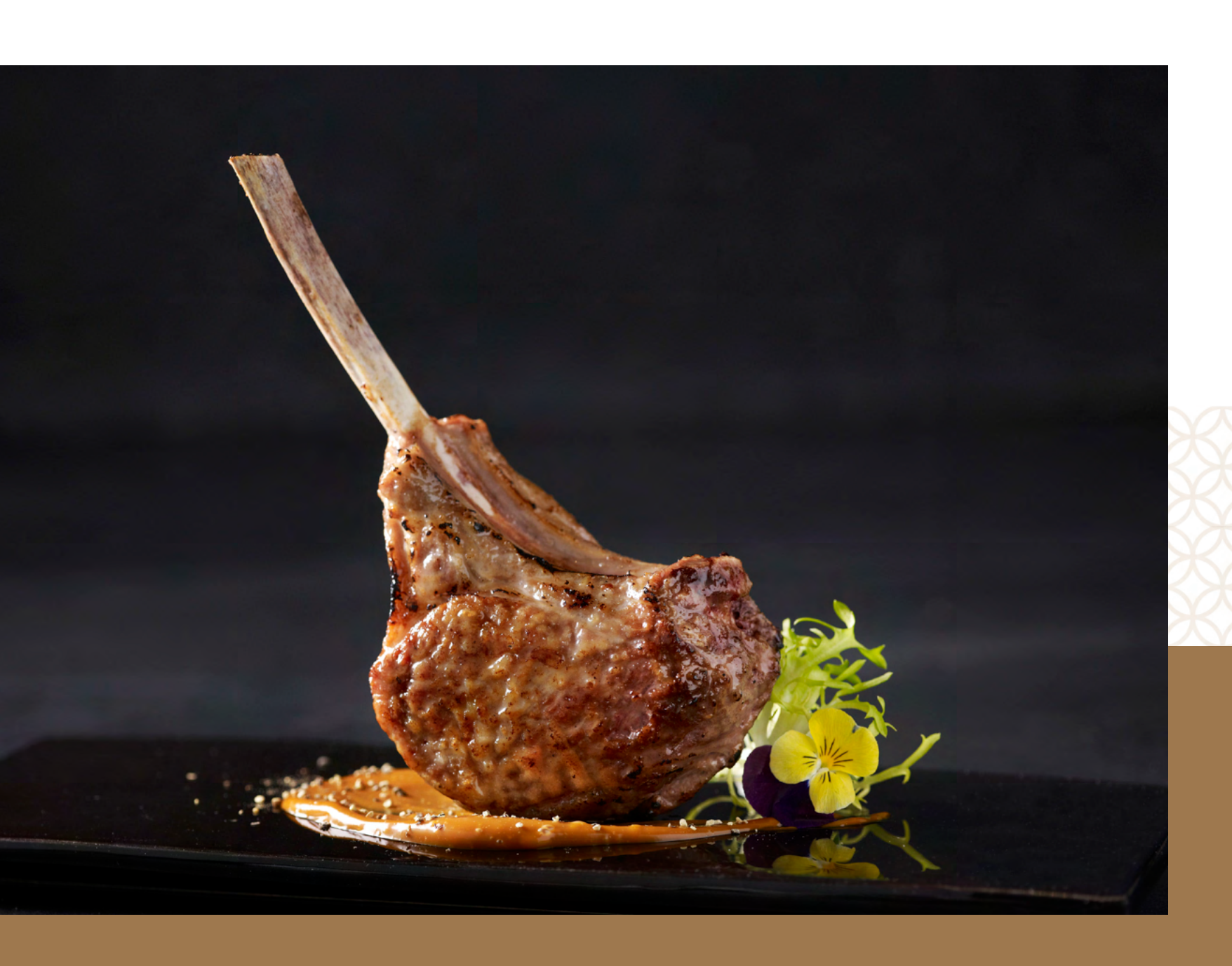
羊方藏鱼 Lamb Rack stuffed with Diced Fish in Feather Light Batter