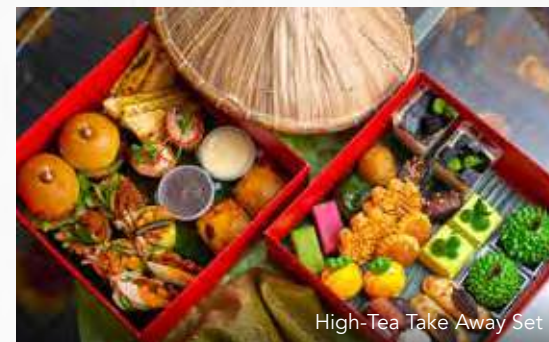
High-Tea Take Away Set

FREE DELIVERY for orders above RM200 within 5km radius. Delivery fees apply for orders less than RM200, actual fee is subject to the location.