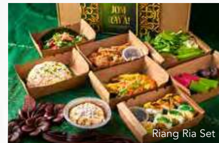
Riang Ria Set

Ramadhan month is upon us, and not forgetting preparations for the upcoming Eid celebrations. With so much going on, having food delivered to you turn to be a fuss-free Iftar.