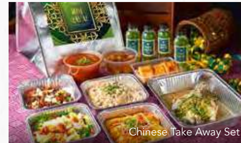
Chinese Take Away Set

RM78 nett per person (a minimum order of 4 persons)