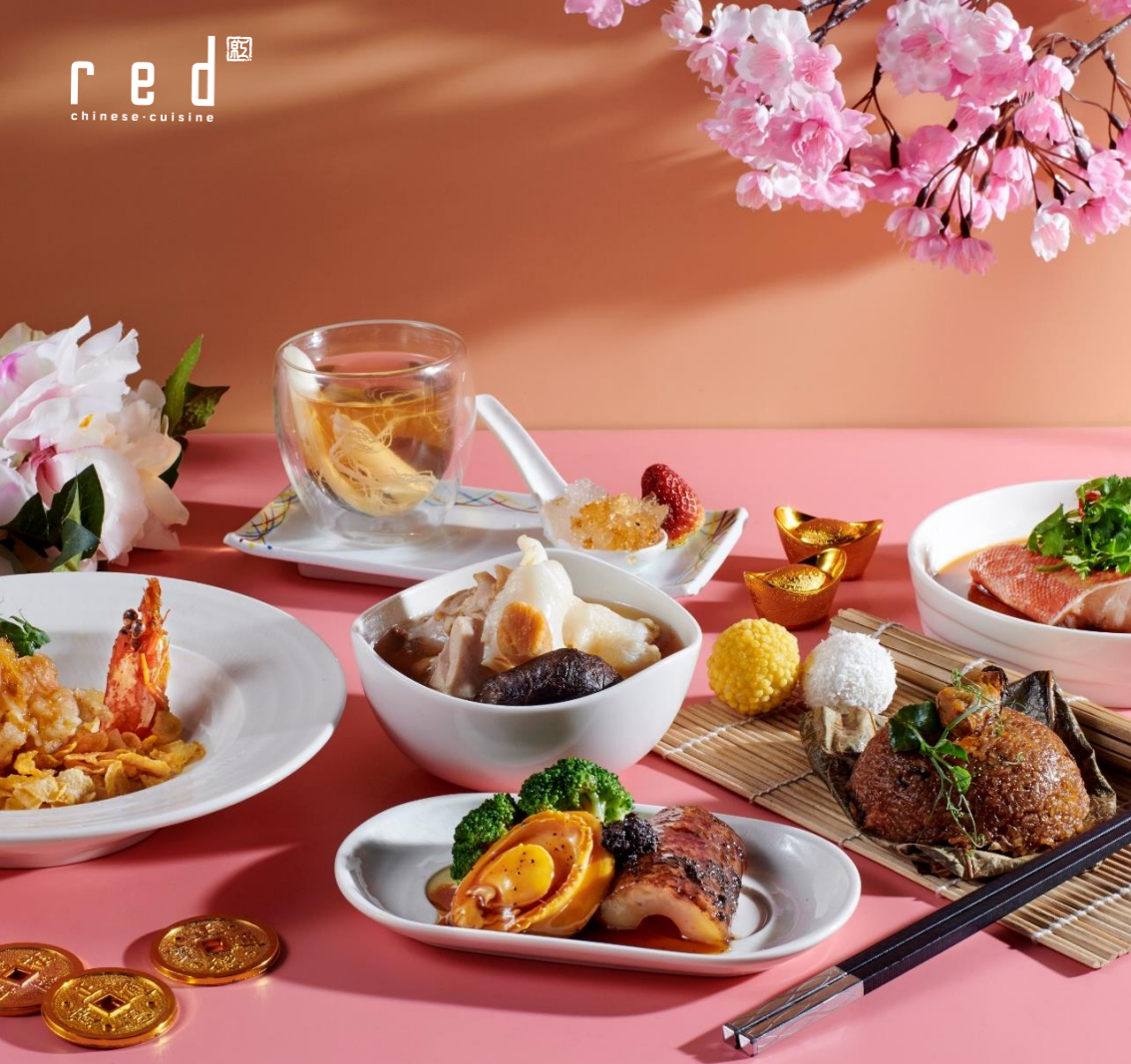
All prices quoted are subject to prevailing applicable taxes.