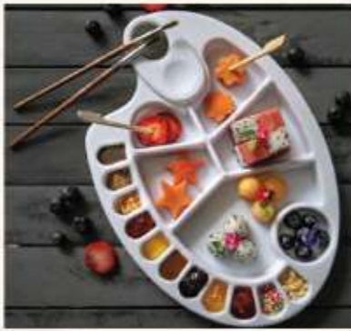
Paint the Fruits ฿150 A selection seasonal fresh fruits, sauces & sweet treats