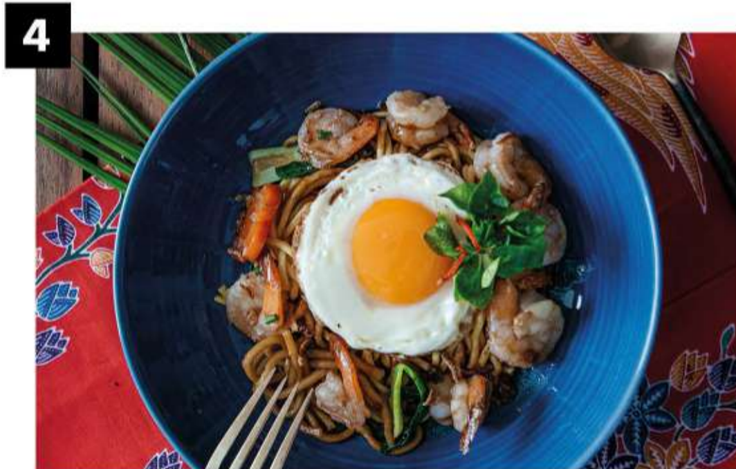
4 Phuket Phad Mee Hokkien Goong B310 Gai/Moo/Nua B290 ผัดหมี่ฮกเกี้ยนไก่/หมู/เนื้อ แบบภูเก็ต

Phuket style wok fried fresh yellow noodles, dark soy sauce, local vegetables & greens.