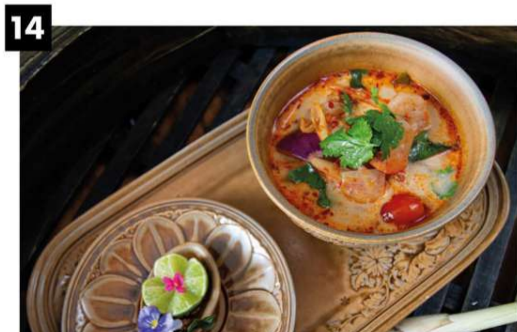
14 Tom Yum Goong ต้มยำกุ้ง Spicy soup with prawns, lemon grass, galangal, kaffir lime leaves, coriander and chili