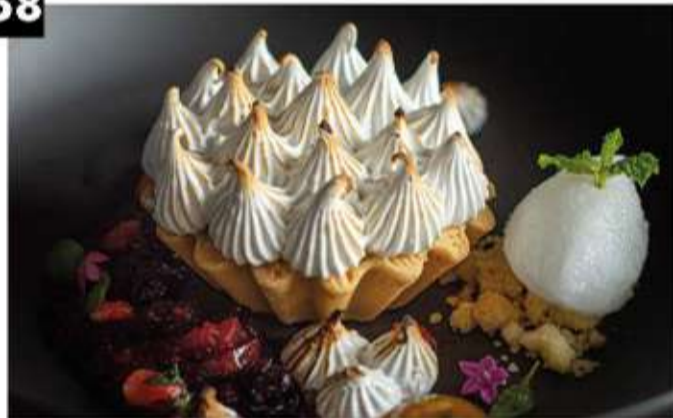
Lemon Meringue Tart ฿215 เมอแรงก์ทาร์ตมะนาว Local lime sorbet, seasonal berry & mint salad, vanilla crumble