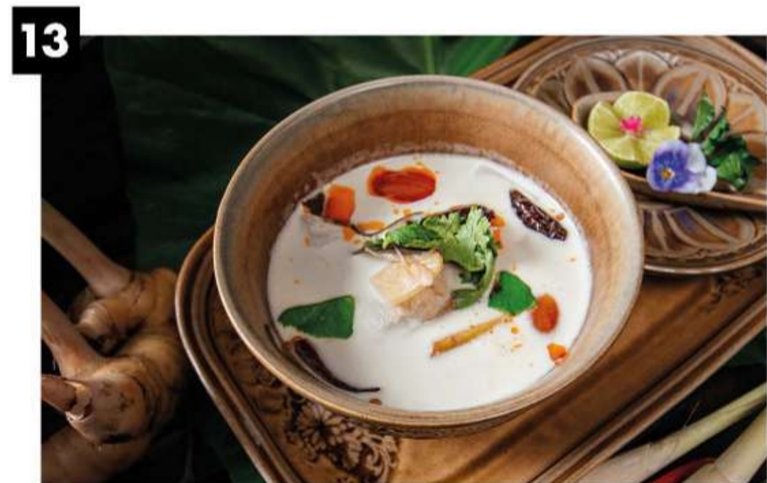
13 Tom Kha Gai ต้มข่าไก่ Coconut and chicken soup infused with lemongrass, kaffir lime leaves, galangal, local mushrooms and shallots