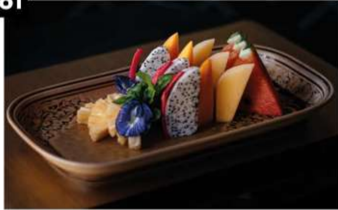
Fresh Phuket Island Fruit ฿195 ผลไม้สดของภูเก็ต A selection of fresh seasonal Phuket fruits