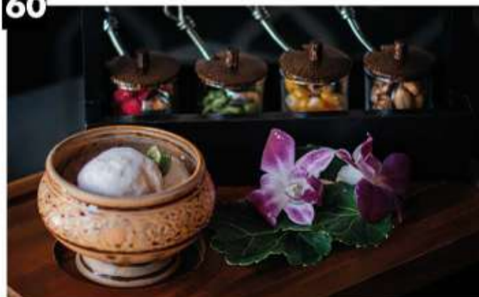
Thai Coconut Ice Cream with Accompaniments ฿190 ไอศกรีมมะพร้าวกับเครื่องเคียงตำรับไทย Roasted peanuts, Phuket pineapple jam, sweet sticky rice and Thai red rubies