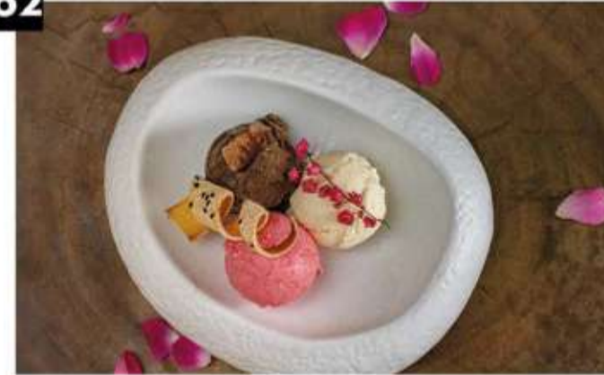
Ice-Cream ไอศกรีม 1Scoop | 2Scoop | 3Scoop Vanilla, Chocolate, Strawberry ฿120 | ฿190 | ฿240 Sorbet ซอร์เบต Mango, Lime, Raspberry

All prices are in Thai baht and subjected to a 10% service charge and 7% government taxes