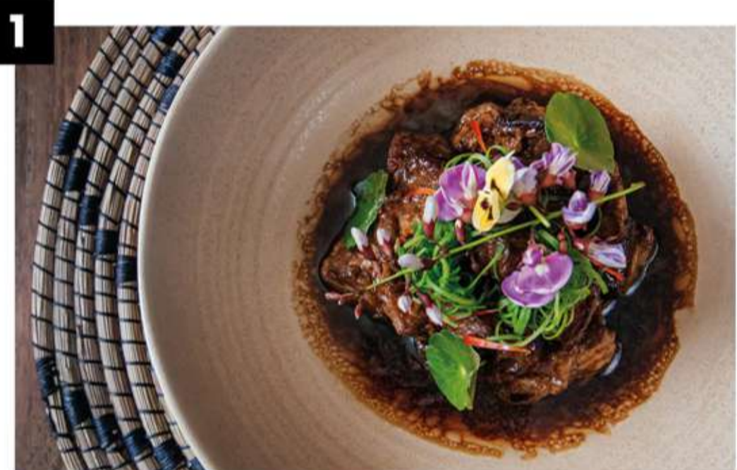
1 Moo Hong Phuket หมูฮ้อง ภูเก็ต