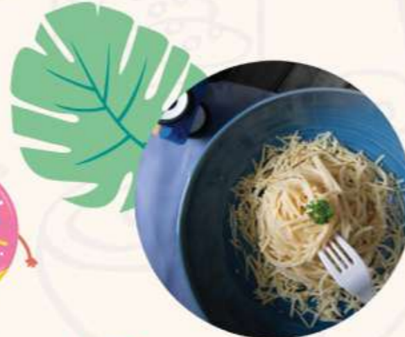
Spaghetti/Penne with Butter & Parmesan ฿210 Spaghetti or penne pasta tossed with salted butter & parmesan