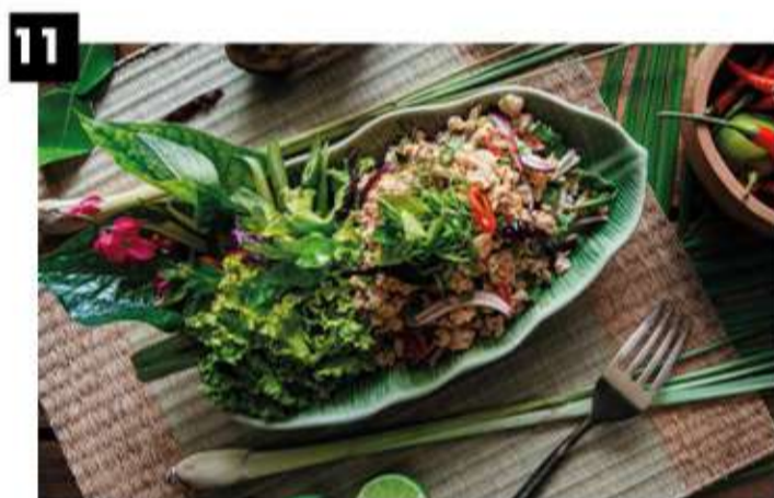
11 Lab Gai ลาบไก่ Chicken mince salad, fresh herbs, onions, roasted rice, chili & lime dressing