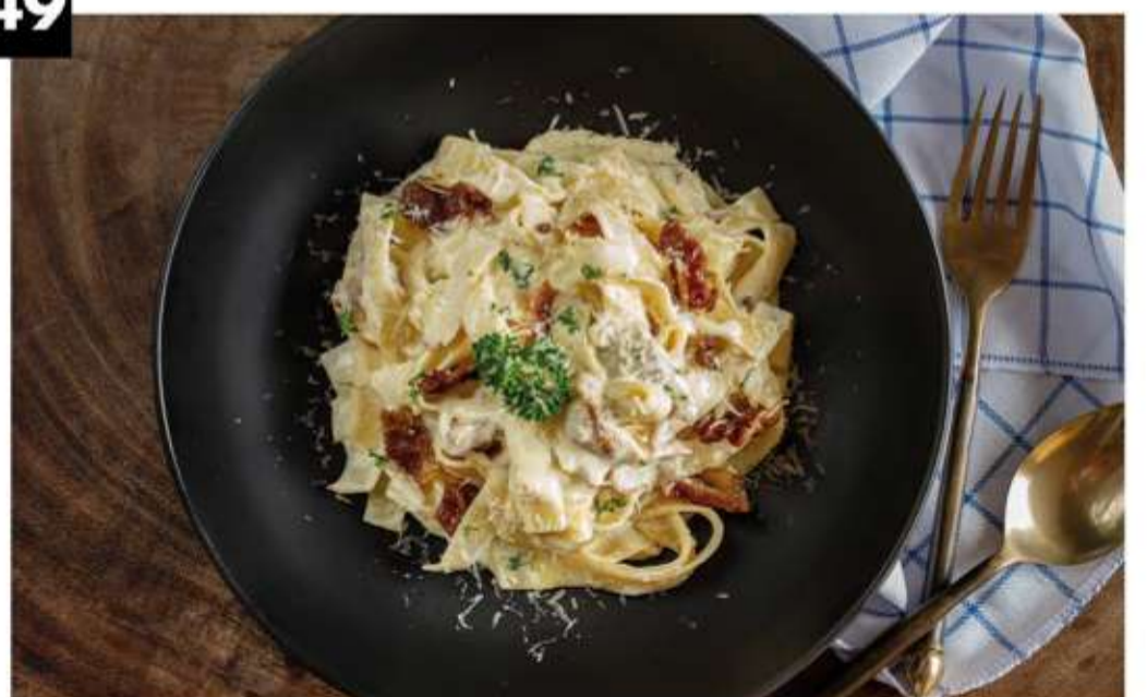
Fettuccine Carbonara 🌿 🥛 ฿310 เฟตตูชินีคาโบนาร่า Fettuccine pasta tossed with bacon, egg, cream, parmesan & black pepper

All prices are in Thai baht and subjected to a 10% service charge and 7% government taxes