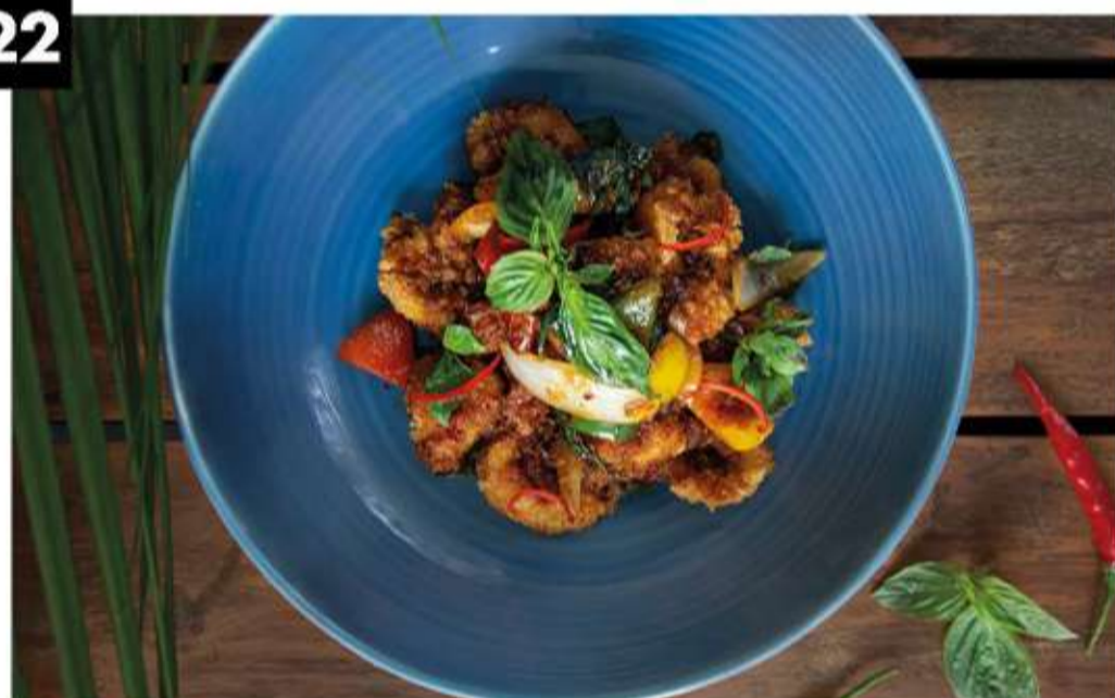
Pla Muek Phad Prik Phao 🐟🌶️ ฿330 ปลาหมึกผัดพริกเผา

Wok-fried calamari tossed in roasted red chili gravy & steamed rice