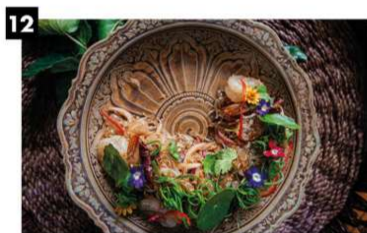
12 Yum Som-O Goong ยำส้มโอกุ้ง Prawns and pomelo salad, shallots, roasted coconut, crushed peanut, kaffir lime leaves, tamarind sauce