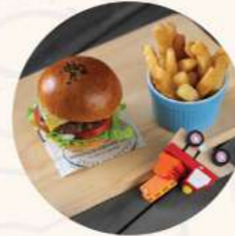
Junior Burger ฿250 Junior beef patty, brioche bun, cheddar cheese, tomatoes, mayo & crinkle cut fries