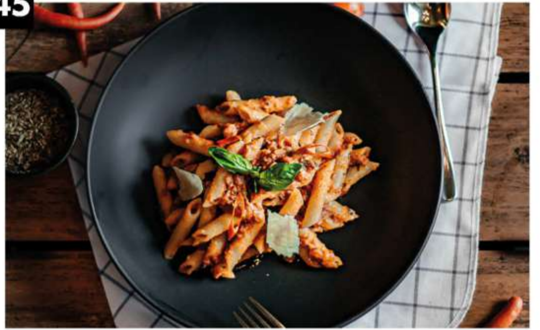
Penne Arrabbiata 🌿 🥛 ฿290 เพนเนอราราบียัตตา Penne pasta, chef's tomato sauce, fresh basil, Thai chili, red onion, garlic & parmesan