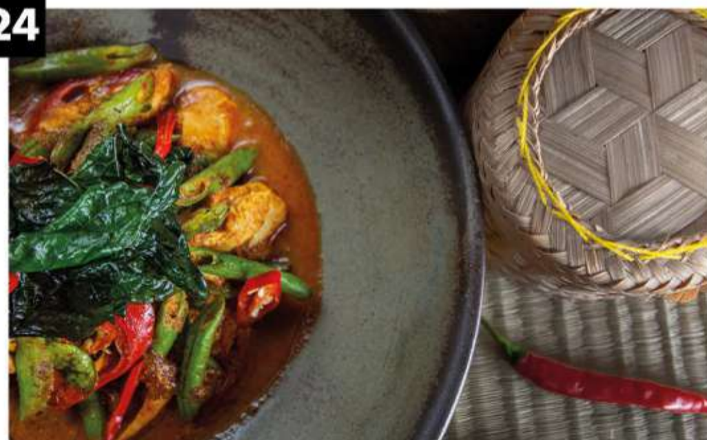
Phad Prik Gaeng: Moo/Gai/Nua 🌶️ ฿285/310/350 ผัดพริกแกงถั่วฝักยาวหมู/ไก่/เนื้อ

Wok-fried pork/chicken/beef with red curry paste, long beans, red chilies & steamed rice