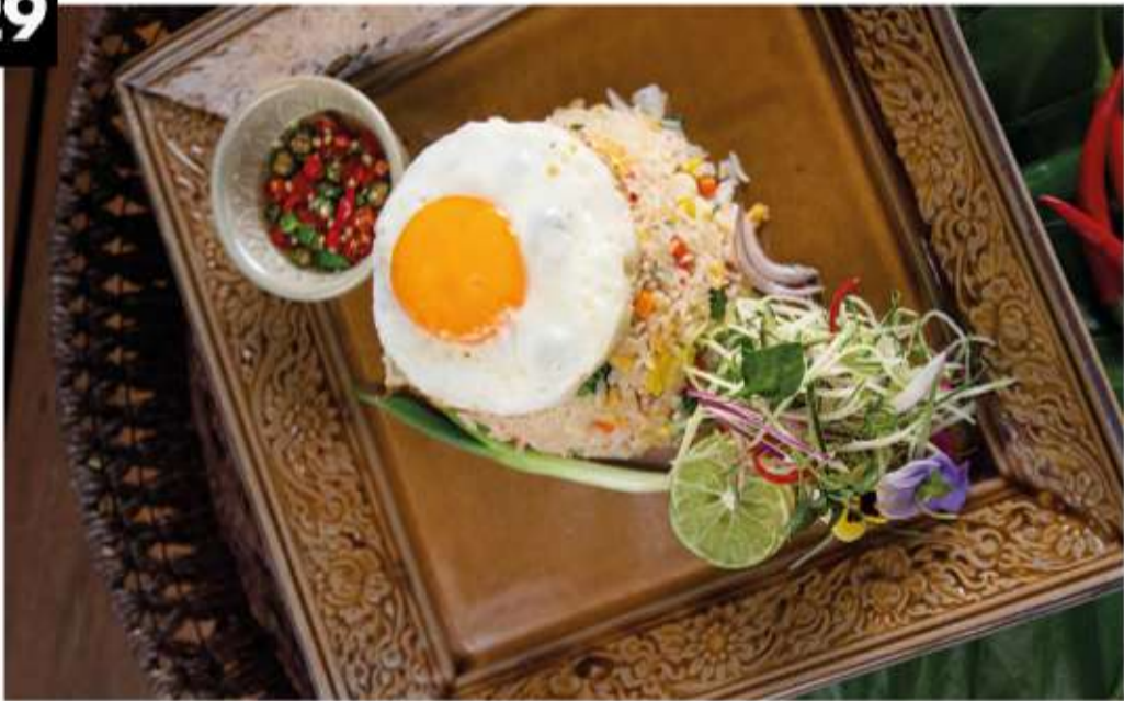
Khao Phad Goong 🐟 ฿310 ข้าวผัดกุ้ง

Stir fried Thai jasmine rice, prawns, topped with fried egg, lime & chili dip