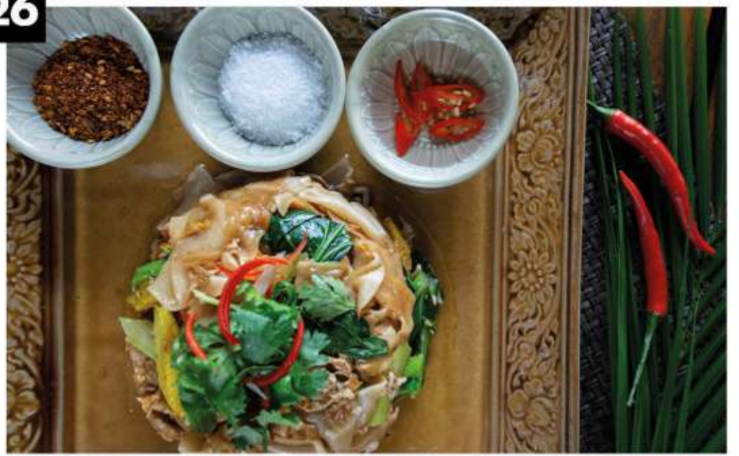
Phad See Ew ฿275 ผัดซีอิ้ว

Thai style wok fried flat rice noodles tossed in dark soy sauce, carrots & kale