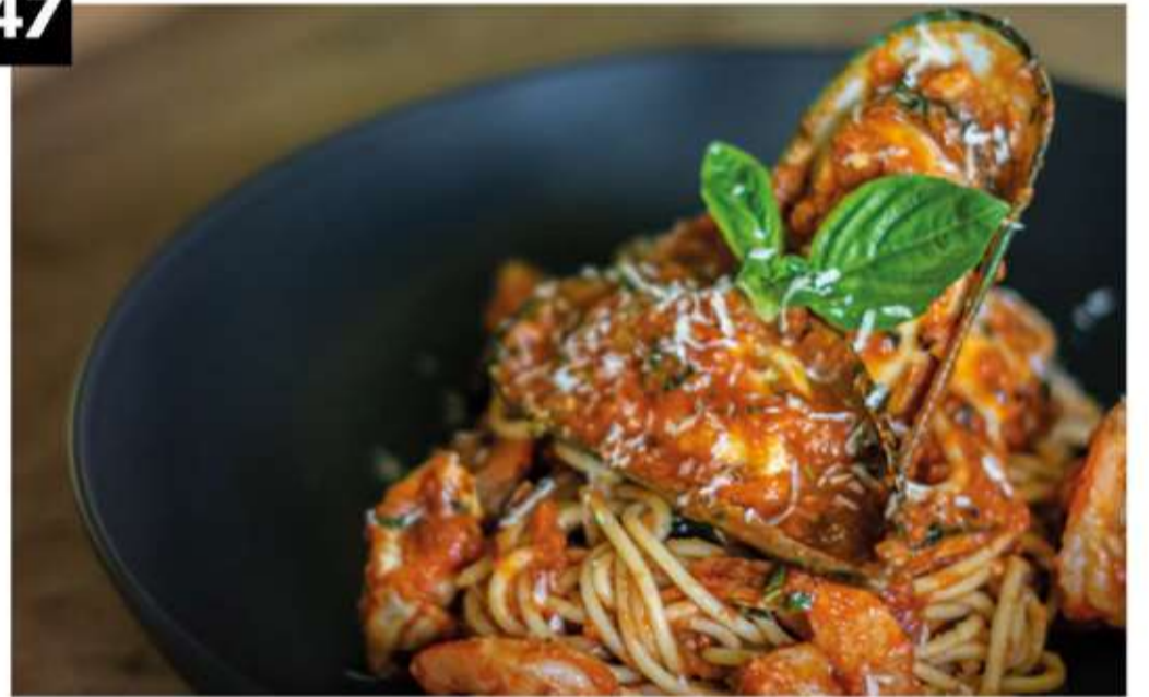
Spaghetti Frutti Di Mare 🌿 🥛 ฿360 สปาเก็ตตี้ ฟรุตตี เดอ แม Spaghetti pasta tossed with prawns, calamari, green shell mussels, parsley, tomato sauce & parmesan