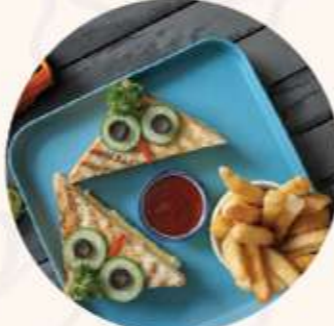
Grilled Cheese Sandwich ฿150 White bread, butter, cheddar cheese, crinkle cut fries, ketchup