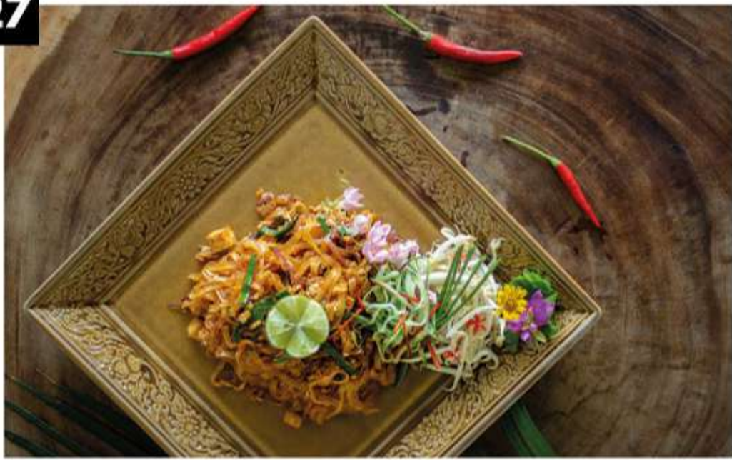
Phad Thai Phak 🌱🥜 ฿290 ผัดไทยผัก

Wok fried rice noodles, tofu, tamarind sauce, bean sprouts, roasted peanuts & spring onions