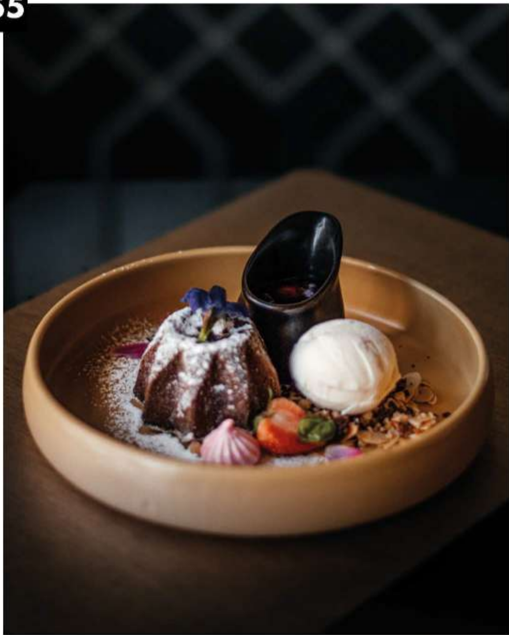
Signature Chocolate Lava Cake ฿225 ช็อคโกแลตลาวา อาหารเอกลักษณ์ประจำร้าน Chocolate crumble, vanilla ice-cream, mixed berry coulis