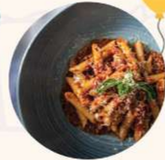
Penne Tomato Sauce ฿215 Penne pasta, chefs tomato sauce, fresh basil, onion, garlic, parmesan