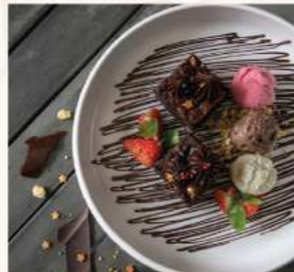
Choco Brownie ฿150 Chocolate brownie, 3 mini scoops of ice-creams