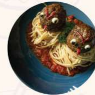
Angry Bird's Meatball Spaghetti ฿240 Spaghetti pasta tossed with beef and tomato sauce, meatballs, parsley, basil & parmesan