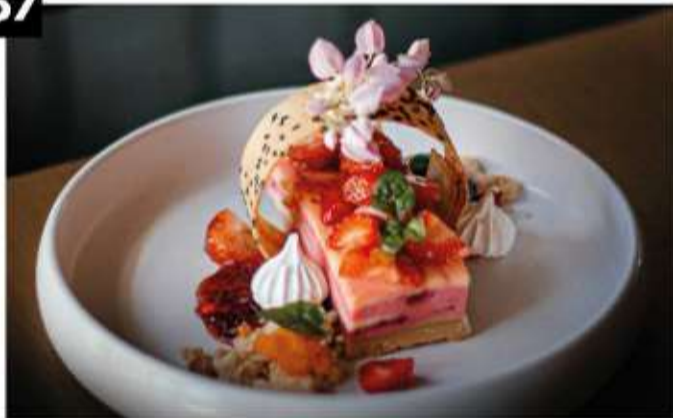
Strawberry Cheesecake ฿200 สตรอเบอร์รี่ชีสเค้ก Baked cheesecake topped with strawberry coulis, mixed nut crumble