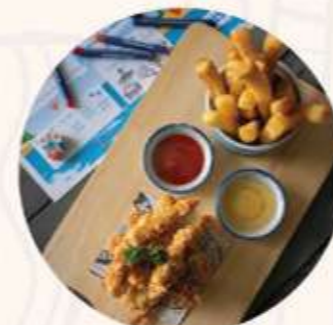
Krispy Chicken Fingers & Fries ฿180 Crinkle cut fries, ketchup & plum sauce