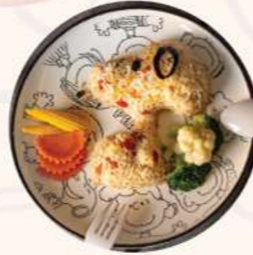
Snoopy Fried Rice ฿160 | ฿180 Veg | Chicken/Pork/Beef/Prawn Stir-fried Thai jasmine rice