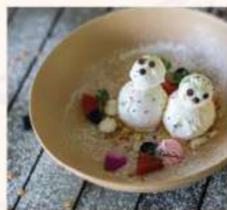
Snowman's Scoops ฿90 | ฿160 1 Scoop | 2 Scoops Vanilla/Strawberry/Chocolate/Coconut/mango & confetti sprinkles