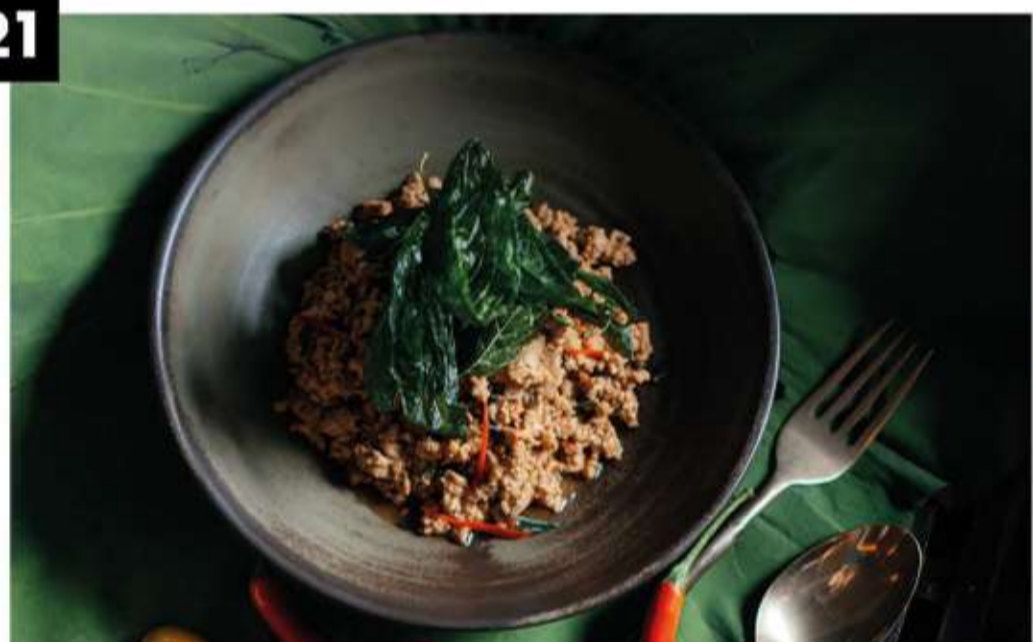
Phad Kra Prow Moo / Gai 👨‍🍳🌶️ ฿285 | ฿310 ผัดกระเพราหมู/ไก่

Stir-fried ground pork/chicken, garlic, chili, hot basil leaves & steamed rice