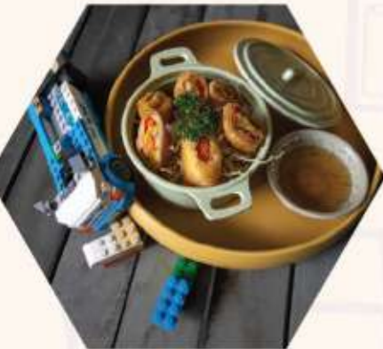
Veg Spring Roll ฿160 Crispy fried veg spring roll, plum sauce