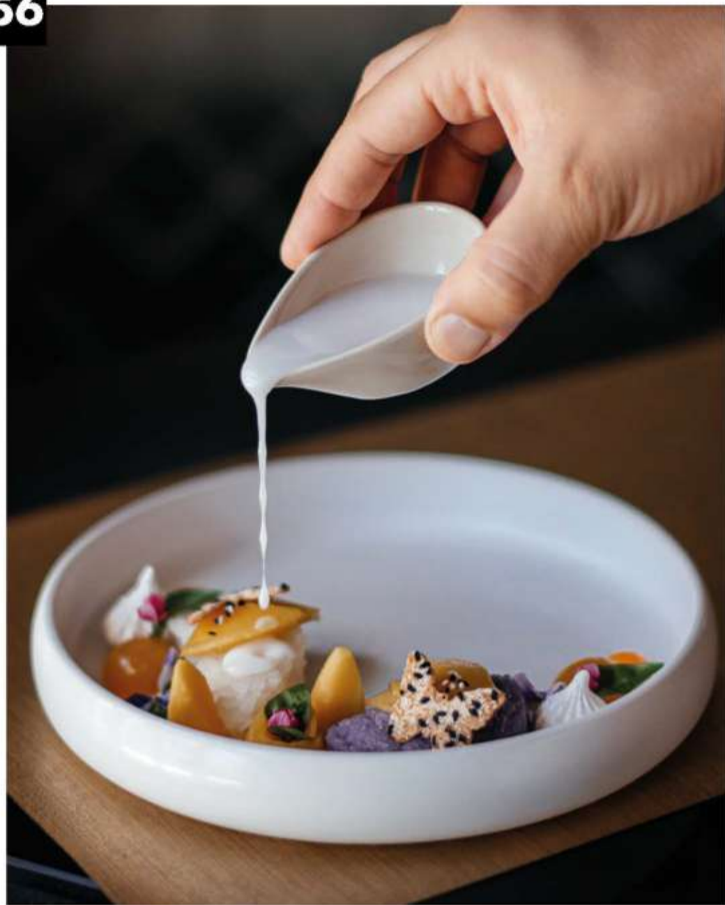
Mango Sticky Rice ฿215 ข้าวเหนียวมะม่วง Thai mango, sweet sticky rice & coconut cream