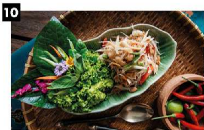
10 Som Tam ส้มตำ Green papaya salad with dried shrimps, cherry tomatoes, beans, peanuts, lime & fish Sauce