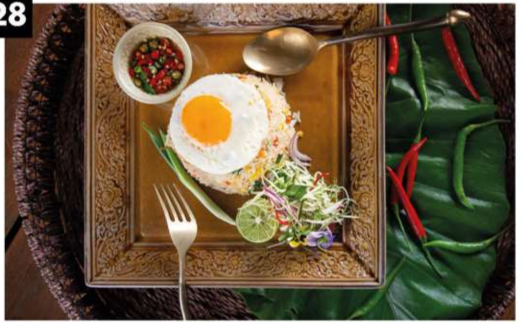
Khao Phad Gai / Moo / Nua ฿290 ข้าวผัดไก่/หมู/เนื้อ

Stir fried Thai jasmine rice, choice of chicken/pork/ beef topped with fried egg, lime & chili dip