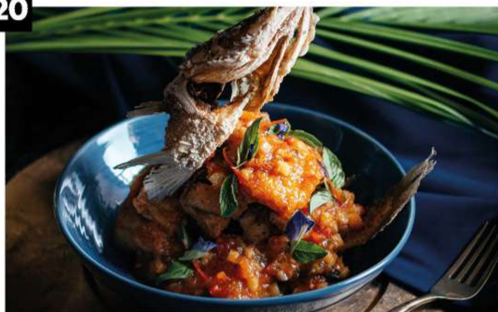
Pla Tod Sam Rod 🌾🐟🌶️ ฿599 ปลาทอดสามรส

Whole Andaman sea bass (500-600 grams), three flavor sauce, chilies, onions, bell pepper, phuket pineapple & steamed rice