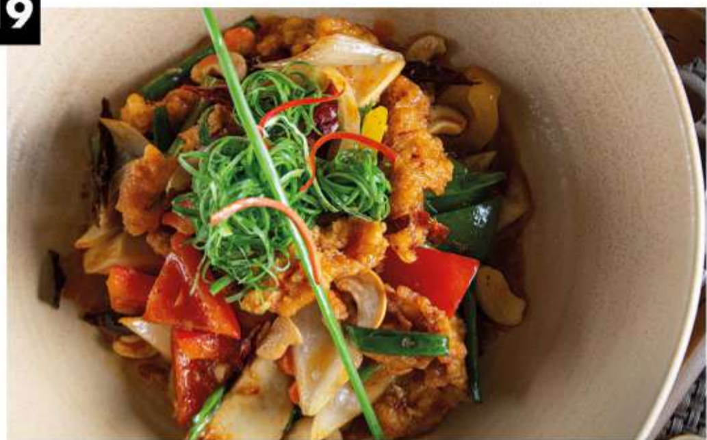
Gai Phad Med Ma Muang Himmaphan 🥜🌶️ ฿315 ไก่ผัดเม็ดมะม่วงหิมพานต์

Wok - fried chicken with bell peppers, mushrooms, dried red chilies, cashew nuts & steamed rice