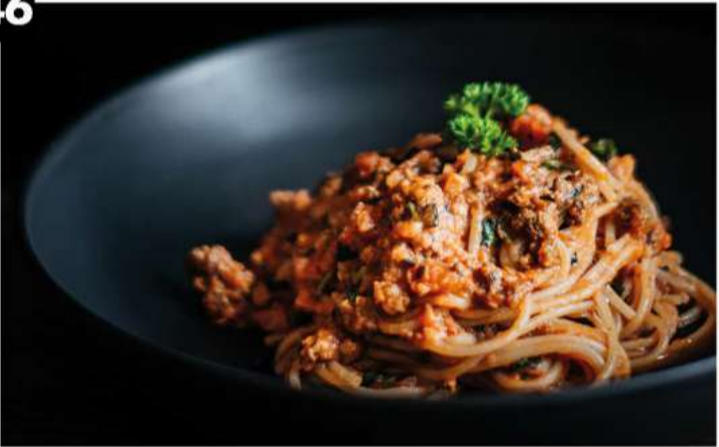
Spaghetti Bolognese 🌿 🥛 ฿310 สปาเก็ตตี้โบโลเนส Spaghetti pasta tossed with ground beef & tomato sauce, parmesan