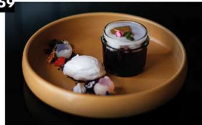
Bi Ko Moi ฿195 บิโกมอย Phuket black sticky rice served with coconut ice cream