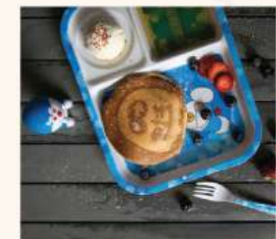
Doremon Pancake ฿150 Maple syrup, vanilla syrup, confetti sprinkles, berries