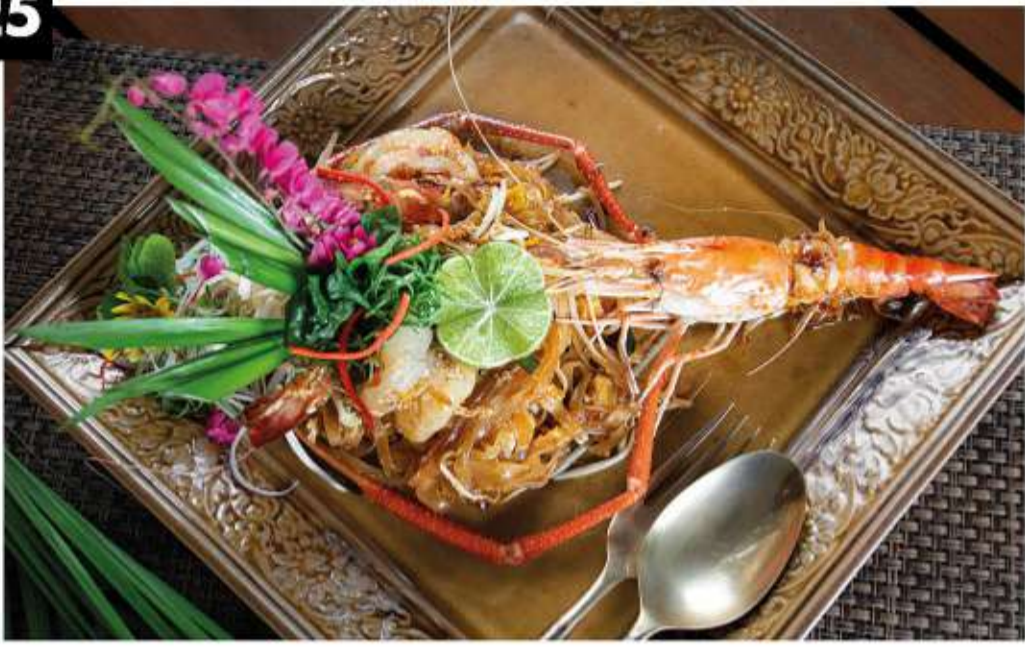
Phad Thai Goong / Gai 🥜👨🍳🐟 ฿320 | ฿290 ผัดไทยกุ้ง/ไก่

Wok fried rice noodles, egg, tofu, tamarind sauce, bean sprouts, roasted peanuts, choice of prawns or chicken