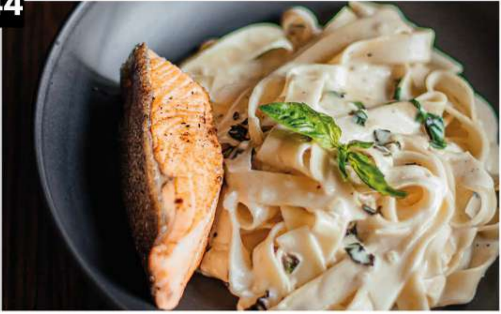
Salmon/Chicken Basil Fettuccine Alfredo ฿495 | ฿325 เฟตตูชินีอัลเฟรโดไก่/แซลมอน 🌿 🥛 Fettuccine pasta tossed with onion, garlic, basil, Alfredo sauce, choice of pan seared salmon or roasted chicken breast