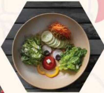
Clown's Green Salad ฿120 Shredded carrots, cucumber, red radish, tomato, bell pepper, feta, olives, lemon & herb dressing