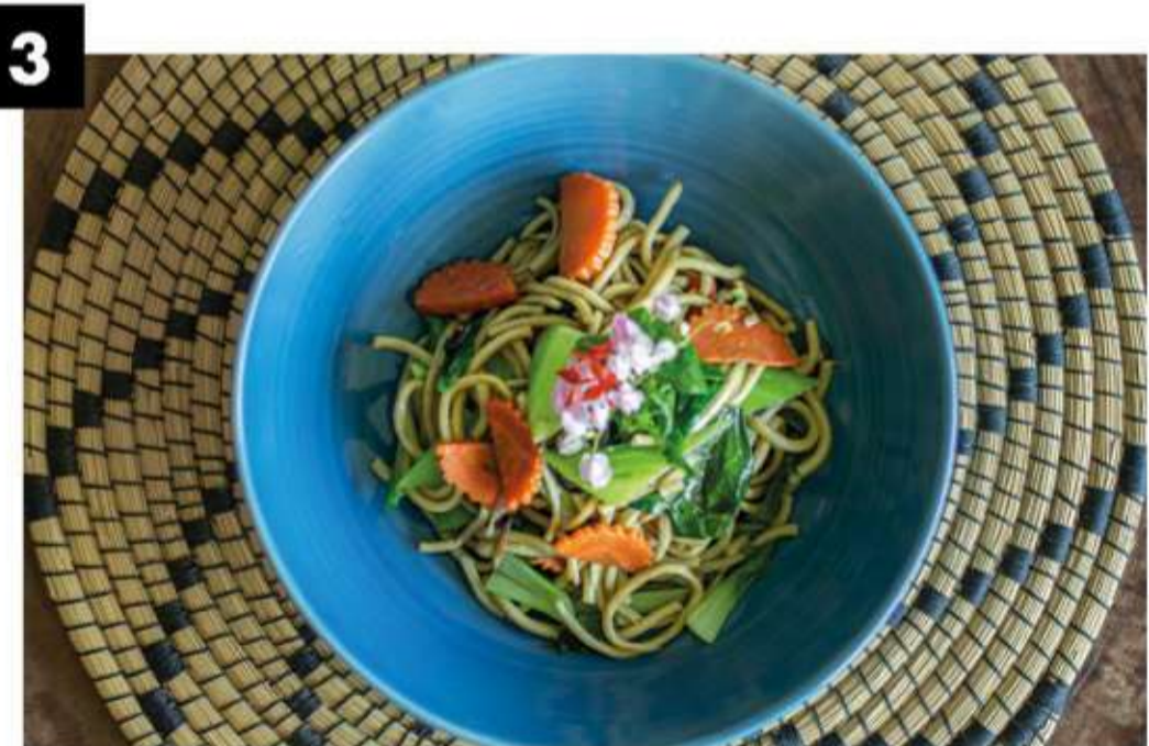
3 Phuket Phad Mee Hokkien Phak ผัดหมี่ฮกเกี้ยนผัก แบบภูเก็ต

Crab curry with betel leaves served with rice vermicelli noodles