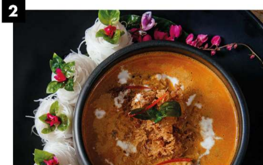
2 Phuket Style Crab Curry เส้นหมี่น้ำยาปูภูเก็ต

Traditional Phuket style pork belly stewed for 4 hours with garlic, peppercorns, soy sauce, coriander roots & served with steamed rice