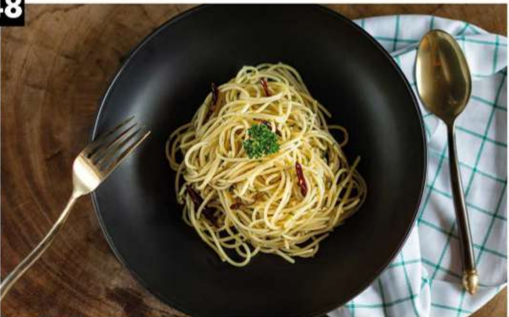
Spaghetti Aglio Olio e Peperoncino 🌿 🥛 ฿285 สปาเก็ตตี้ อายโย โอริโอ เอ เปปเปอร์อนชีโน่ Spaghetti pasta tossed with olive oil, garlic, chili, parsley & parmesan