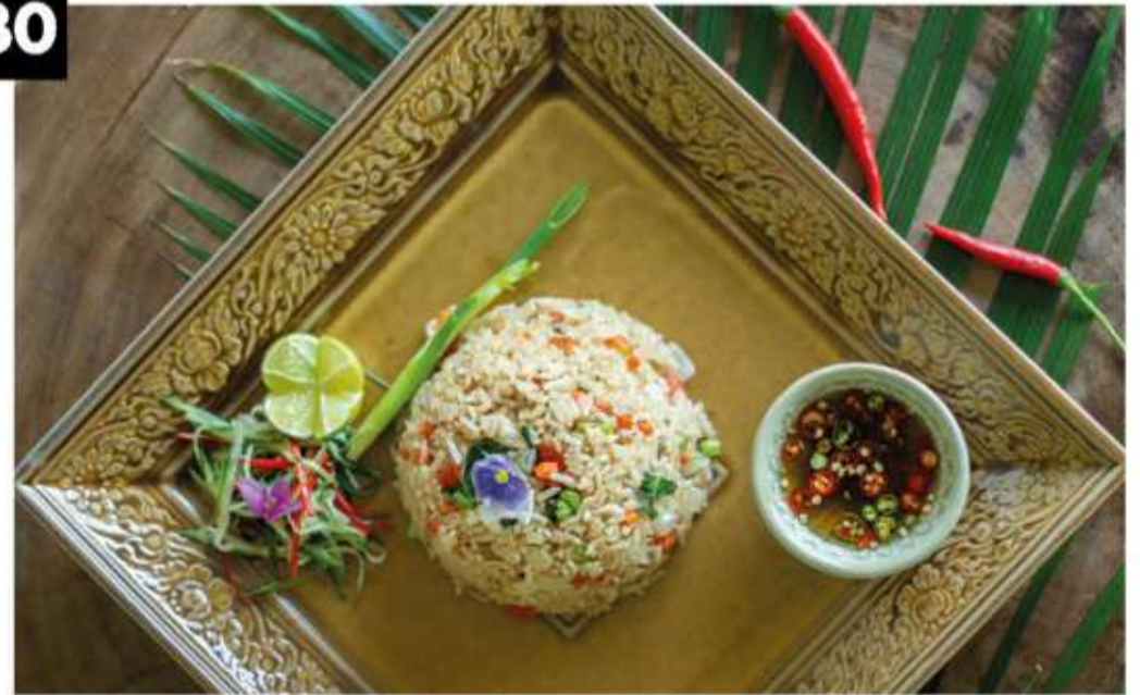
Khao Phad Phak 🌱 ฿240 ข้าวผัดผัก

Stir fried Thai jasmine rice with vegetables, lime & soy dip