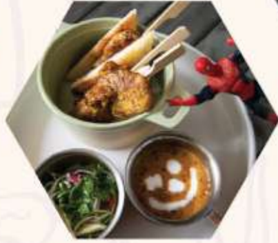
Chicken Satay Skewers ฿180 Skewered chicken, pickled onion, cucumber, peanut sauce