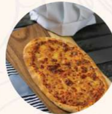
Pizza Margherita ฿220 Fresh basil, house made tomato sauce, mozzarella, tomatoes