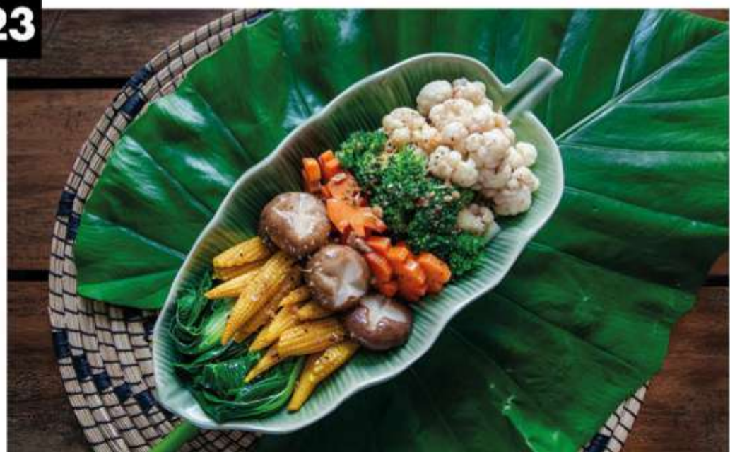
Phad Phak Ruam Mit Nam Man Hoi Thai 🌿 ฿260 ผัดผักรวมมิตรน้ำมันหอย

Wok-fried seasonal vegetables tossed in oyster sauce & steamed rice