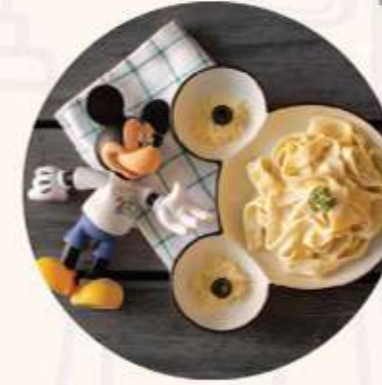
Mickey's Creamy Fettuccine ฿220 Alfredo Fettuccine pasta tossed with garlic, basil parmesan & creamy alfredo sauce