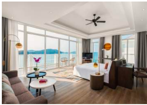
On the Rock Villa