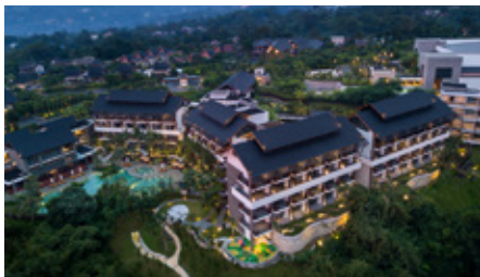
Built on a first class nature-friendly property: Vimala Hills Villa & Resort