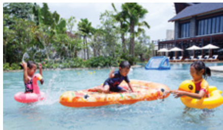
Kids Playground with complete facilities and exciting activities every day