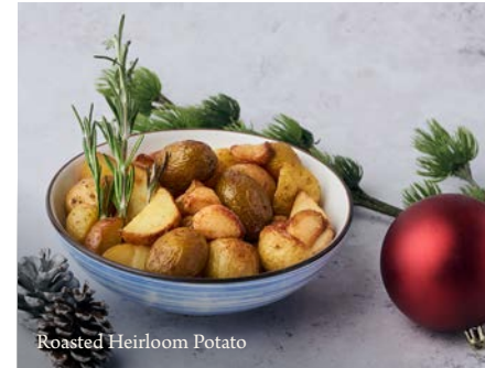
Roasted Heirloom Potato