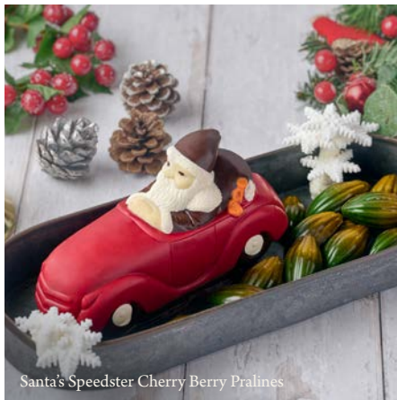
Santa's Speedster Cherry Berry Pralines