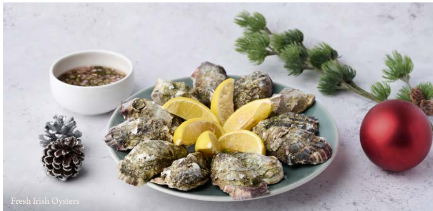
Fresh Irish Oysters