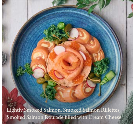
Lightly Smoked Salmon, Smoked Salmon Rilletes, Smoked Salmon Roulade filled with Cream Cheese