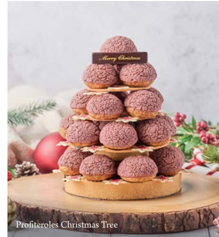
Profiteroles Christmas Tree