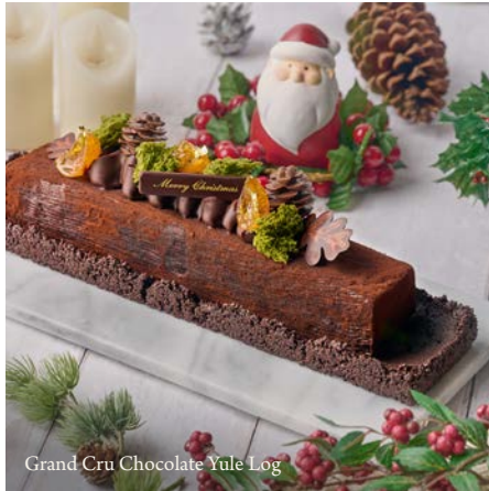
Grand Cru Chocolate Yule Log