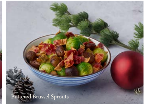
Buttered Brussel Sprouts