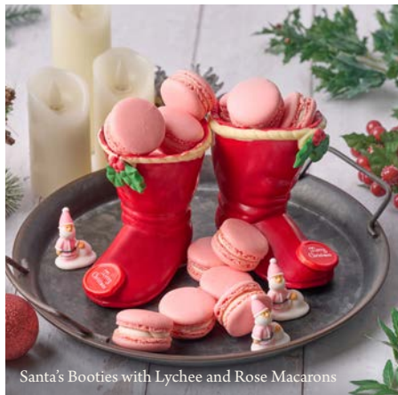
Santa's Booties with Lychee and Rose Macarons