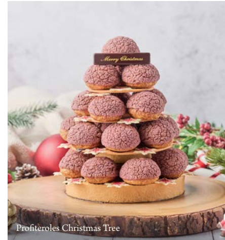
Profiteroles Christmas Tree