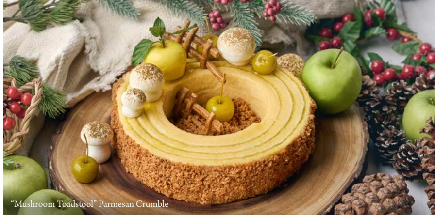
"Mushroom Toadstool" Parmesan Crumble