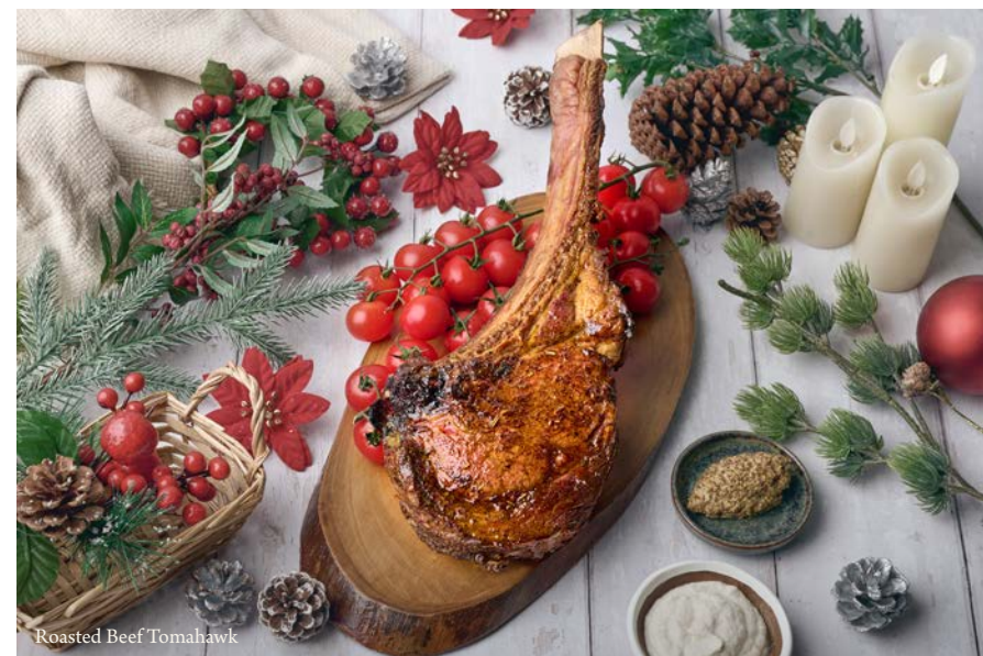
Roasted Beef Tomahawk