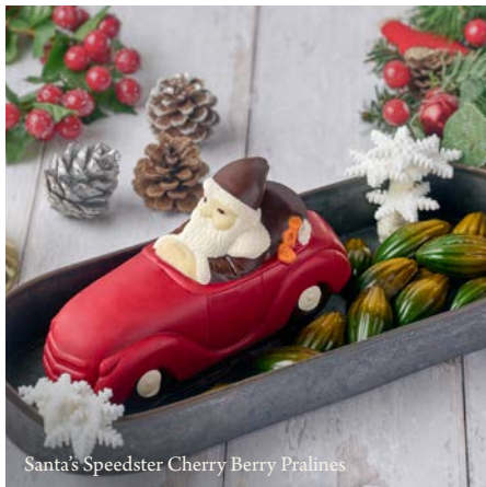
Santa's Speedster Cherry Berry Pralines