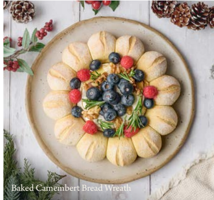
Baked Camembert Bread Wreath