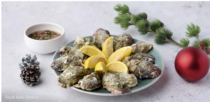
Fresh Irish Oysters