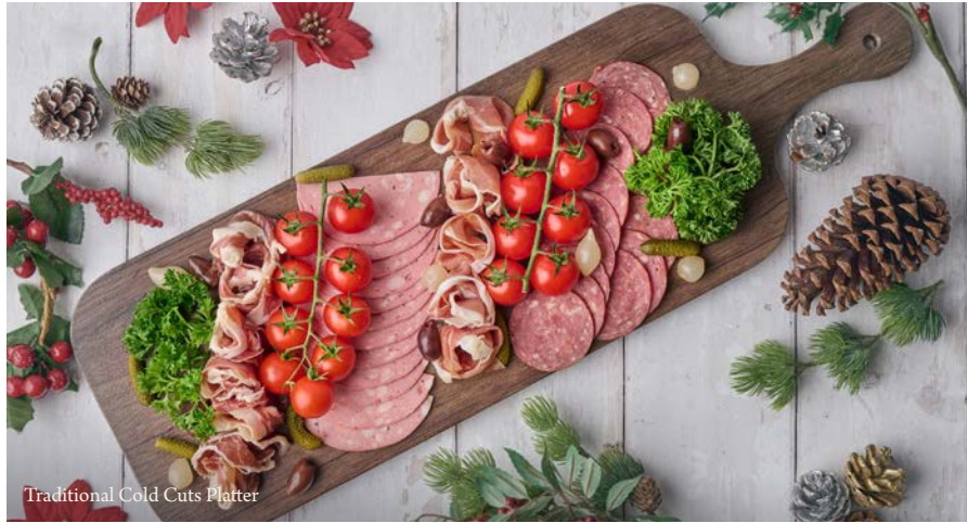
Traditional Cold Cuts Platter