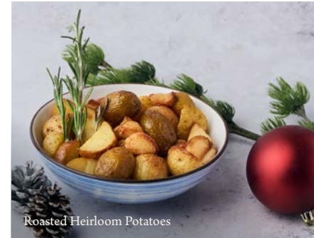
Roasted Heirloom Potatoes