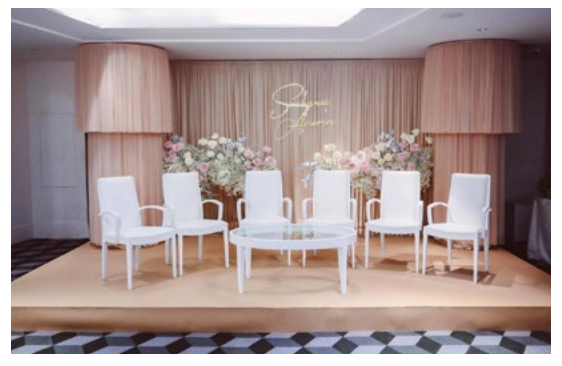
THE GALLERY 36