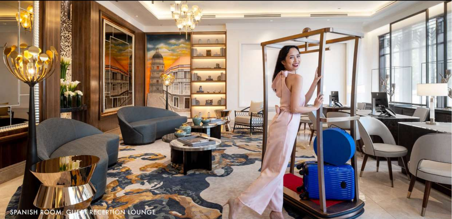
SPANISH ROOM: GUEST RECEPTION LOUNGE