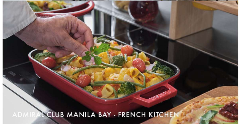
ADMIRAL CLUB MANILA BAY - FRENCH KITCHEN

Give us a call at +63 2 5318-9000 | +63 917-863-6614