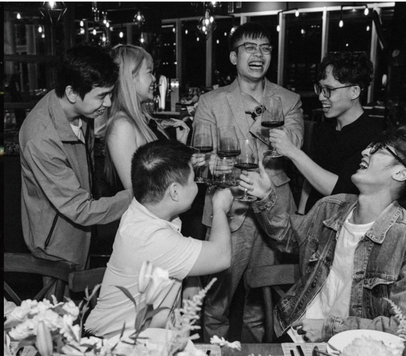
Night sky views, creative cocktails and rooftop vibes - late parties at Mad Cow Phu Quoc are undoubtedly lit!