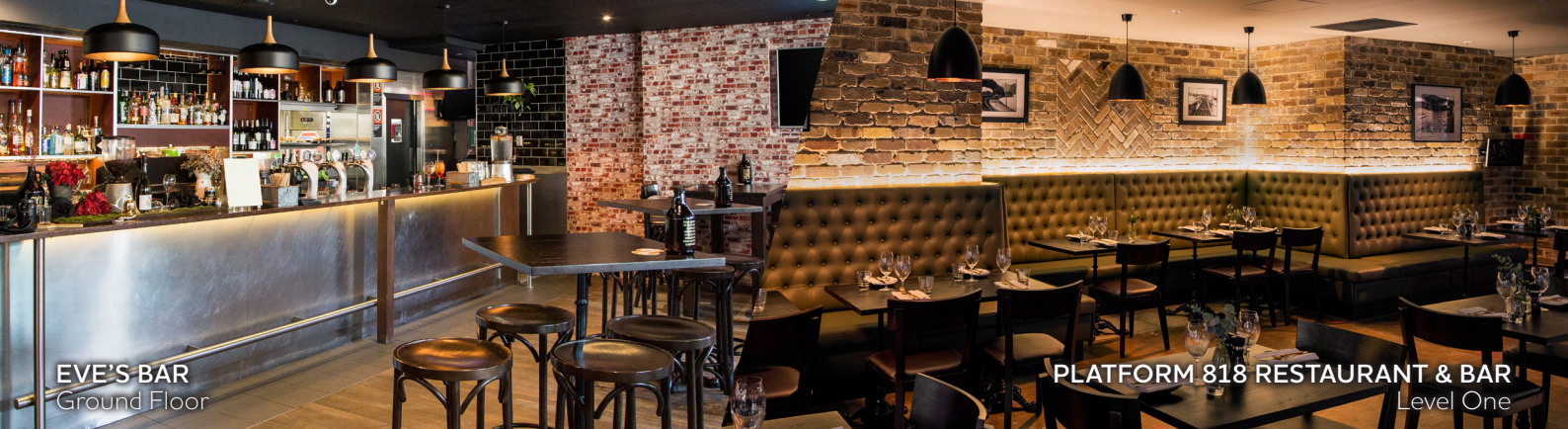
EVE'S BAR Ground Floor