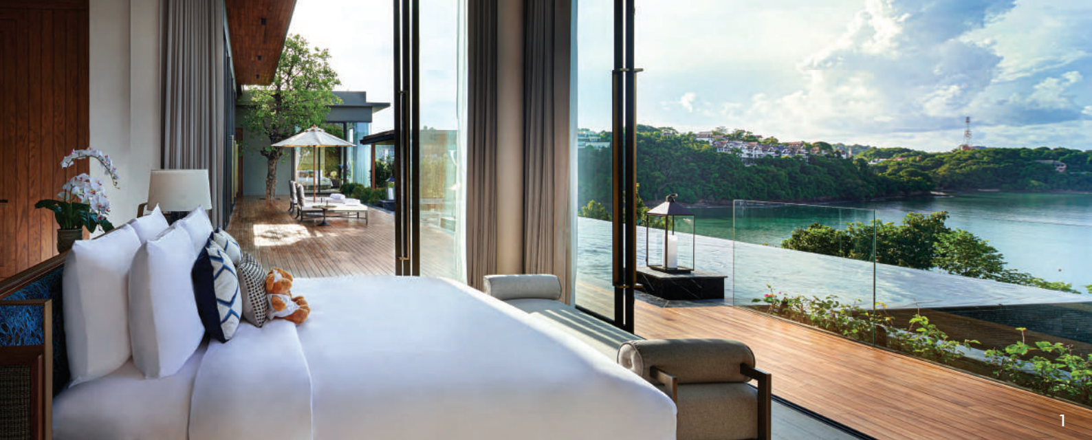
1. Four-Bedroom Presidential Hilltop Villa — 2. One-Bedroom Hill View Villa 3. One-Bedroom Sea View Villa — 4. Three-Bedroom Sea View Villa