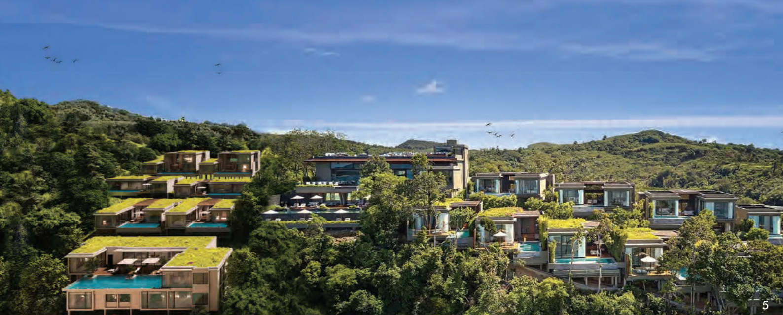
5. An Architectural Rendering of V Villas Phuket's New Private Pool Villas Overlooking Ao Yon Bay. 6. Three-Bedroom Executive Sea View Villa