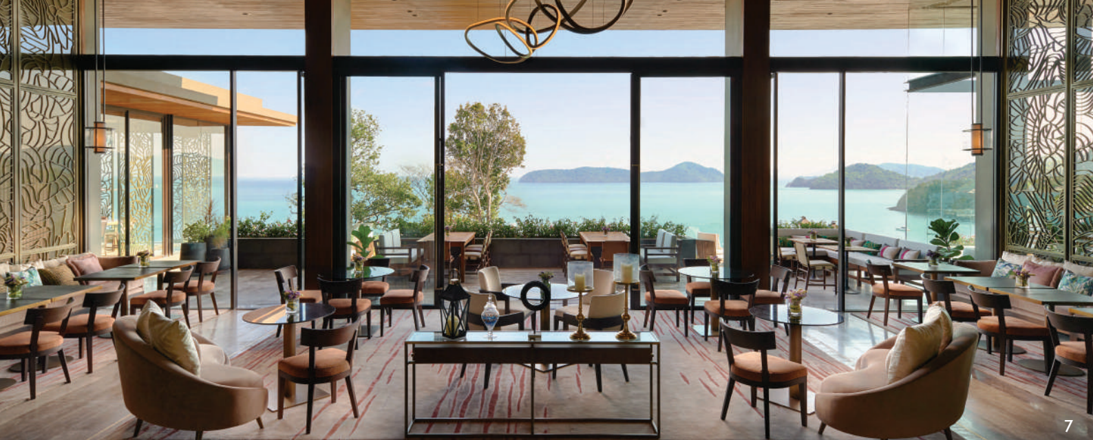
7. Yon|Ocean House — 8. Piano Bar at Yon|Ocean House — 9. Akoya|Star Lounge