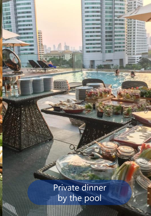
Private dinner by the pool