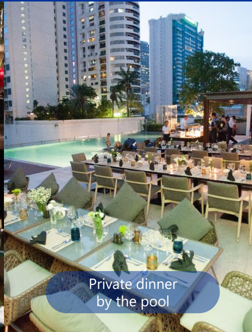
Private dinner by the pool