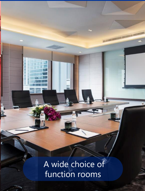
A wide choice of function rooms