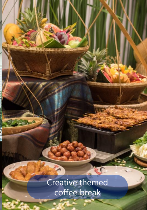
Creative themed coffee break