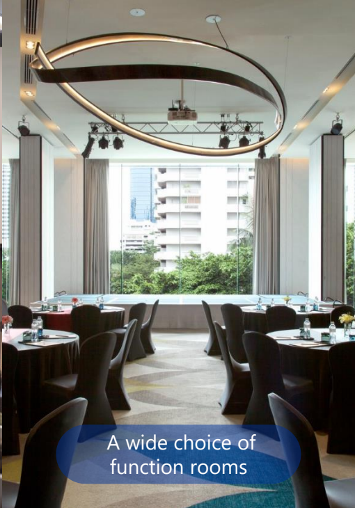
A wide choice of function rooms