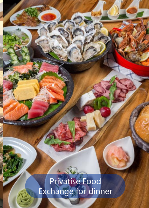
Privatise Food Exchange for dinner

Included in the meeting package services are as followed: