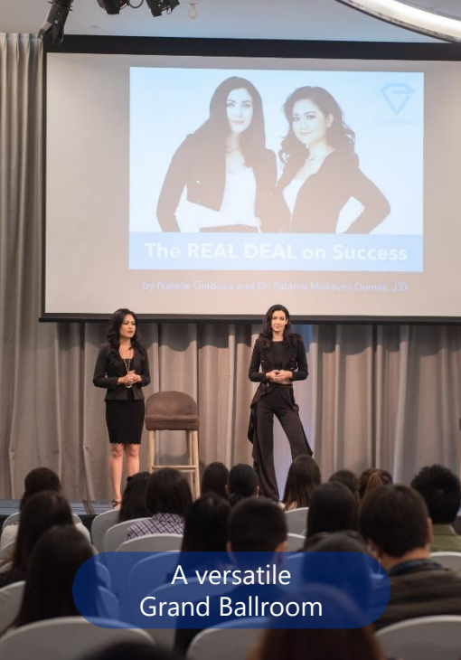
A versatile Grand Ballroom