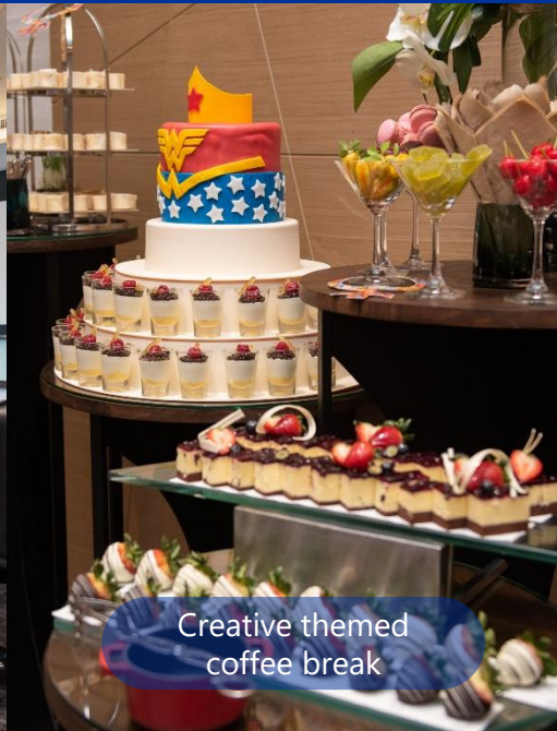
Creative themed coffee break