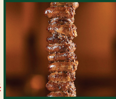
CHICKEN HEARTS หัวใจไก่

Boneless leg of lamb with a flavorful herb paste and encased in a flavorful herb crust