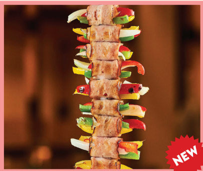
TRICOLOR PEPPER WITH BACON เบคอนพริกหยวก

A colorful pepper with smoked bacon flavor