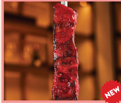
RED PORK CHAR SIU หมูแดงชาซีว

House-made sausages seasoned with Brazilian spices