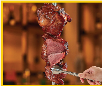
HONEY HAM ฮันนีโฮม

Unique and delicious way to grill steak with crusted parmesan cheese