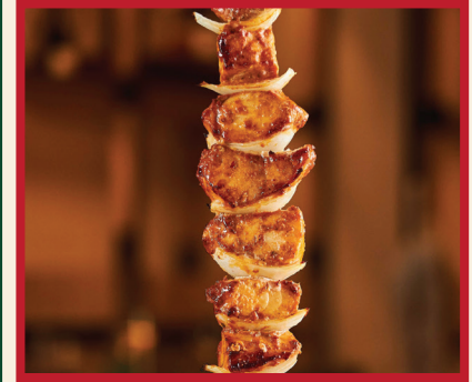
MARINATED BUTTER FISH ปลาทูน่ารมไฟ

Marinated chicken heart perfectly seasoned