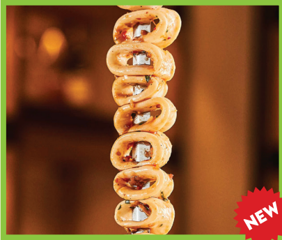
GRILLED CALAMARI คัปปิกย่าง

Tender steak seasoned with garlic, butter and fresh herbs