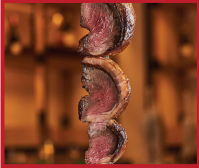
PICANHA (RUMP CAP) พิกานย่า

The prime part of the sirloin seasoned with sea salt and served thin sliced