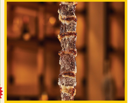
GARLIC STEAK เนื้อกระเทียม

Smoky duck breast with rich flavor and crispy skin