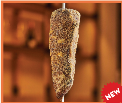
PARMESAN CHEESE STEAK เนื้อพาร์มาซานชีส

A colorful pepper with smoked bacon flavor