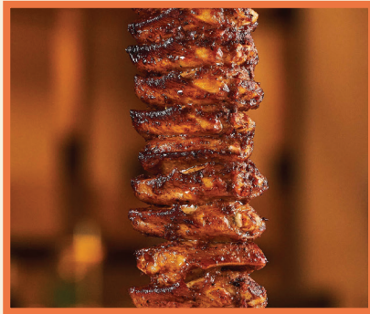
CHICKEN WINGS ปีกไก่

Tender calamari rings with dry peanuts and chili sauce