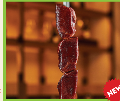
SMOKED DUCK BREAST อกเป็ดรมควัน

Marinated red pork in sweet, Asian-style homemade sauce