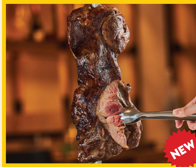
HERBED LAMB LEG (BONELESS) ขาแกะหมักสมุนไพร

Marinated chicken wings perfectly seasoned