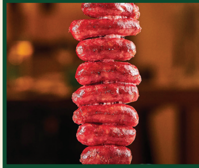
BRAZILIAN PORK SAUSAGES ไส้กรอกหมูบราซิล

The prime part of the sirloin seasoned with sea salt and served thin sliced