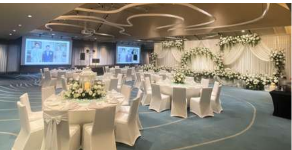
Two Elegant Indoor Ballrooms

A breathtaking rooftop venue offering unmatched sea and mountain views. The ultimate setting for intimate ceremonies and unforgettable wedding photography.