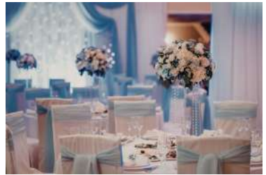
Chinese set menu