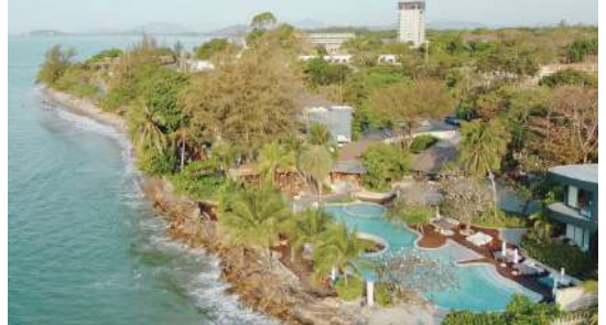
Ocean Wing Beachfront Terrace

Lush greenery meets refreshing sea breezes. An enchanting outdoor venue designed for intimate ceremonies and vibrant pre-wedding gatherings.