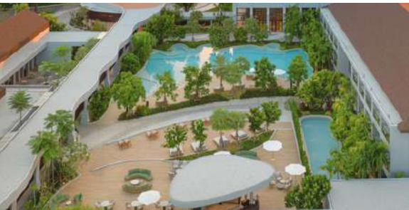
Garden Wing Poolside Venue

A stunning seaside location perfect for sunset ceremonies or wedding receptions.