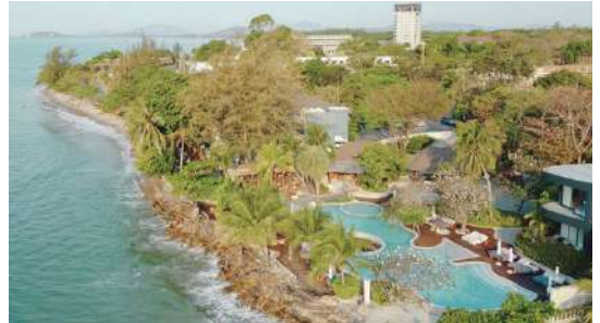
Ocean Wing Beachfront Terrace

A lush garden setting with refreshing sea breeze — ideal for Mehendi, Haldi or intimate ceremonies.