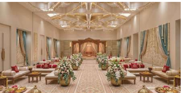
Two Elegant Indoor Ballrooms

Celebrate your sacred ceremony at KOH17, offering panoramic sea and mountain views, a unique and breathtaking setting for the Mandap.