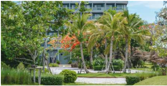
Tropical Garden Sanctuary

A lush garden setting with refreshing sea breeze — ideal for Mehendi, Haldi or intimate ceremonies.