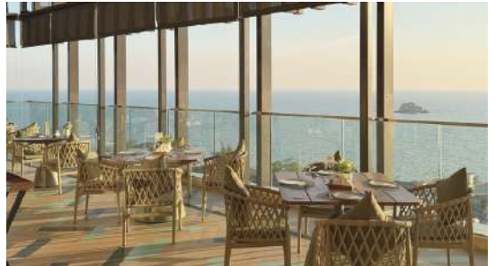
Koh17 Rooftop Bar – Mandap with a View

A beautiful tropical poolside venue ideal for Sangeet nights, celebrations and cocktail events.