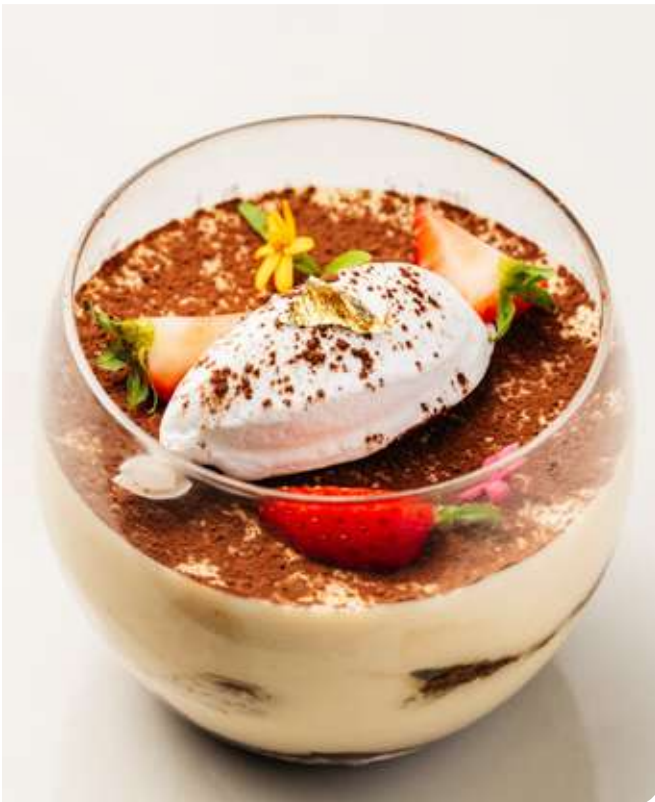
TIRAMISU 350 Light mascarpone mousse, lady finger, espresso, and kalhwa