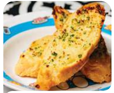
GARLIC BREAD WITH HERBS 180 Grilled bread with garlic butter and herb