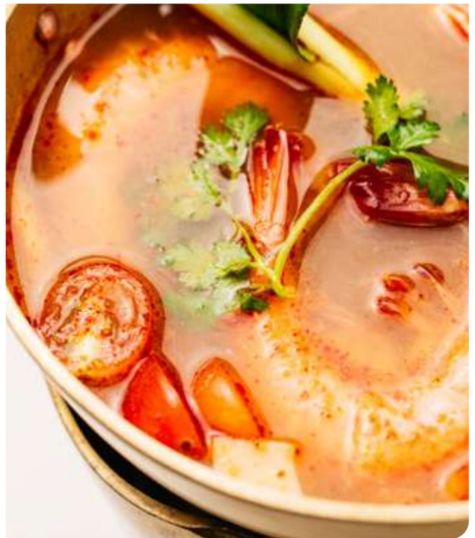
TOM YAM GOONG 310

Broccoli veloute, blue cheese, and fresh herbs crostini