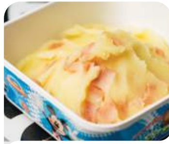
HAM & MASHED POTATO 220 Mashed potato with cooked ham