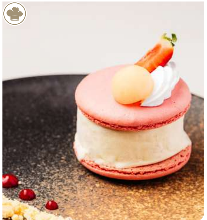
MACARON ICE CREAM 350 Mango, chocolate, vanilla or strawberry

PRICES ARE INCLUSIVE OF TAX AND SERVICE CHARGE