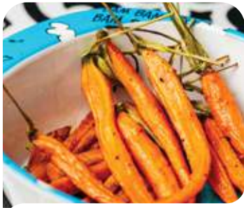
MAPLE ROASTED CARROT 120 Baby carrot roasted with maple syrup