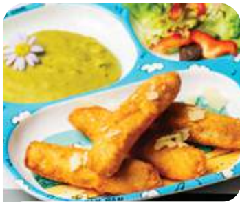
FISH FINGER WITH PARMESAN & MASHY PEA 280 Deep fried fish finger served with parmesan, mashy pea, and tartare sauce