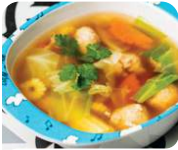
CHICKEN CLEAR SOUP 160 Clear vegetable soup with minced chicken ball