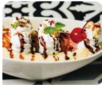
BANANA SPLIT 320 Fresh banana, chocolate, strawberry and vanilla icecream, whipping cream, and chocolate sauce