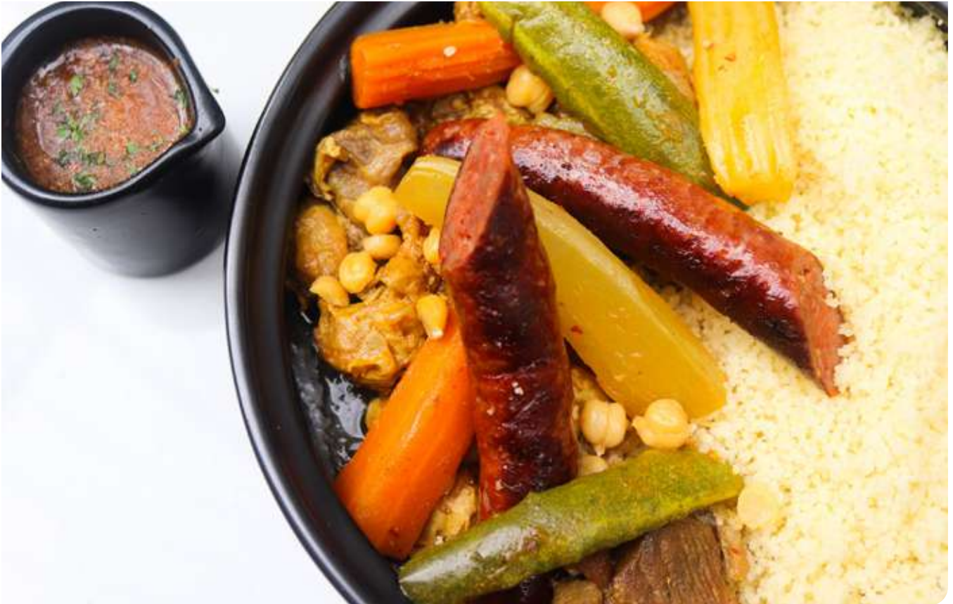
MARROCAN COUSCOUS 700

Slow cooked lamb and chicken, harissa sauce, zucchini, carrot, turnip, chickpea served with couscous semoule