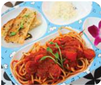
SPAGHETTI POMODORO 160 Spaghetti with tomato sauce, italian basil, and parmesan