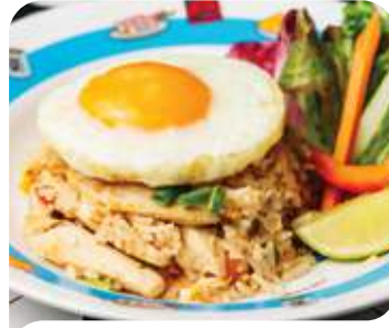
KIDS KHAO PHAD GAI 160 Chicken fried rice served with fried egg and mixed lettuce