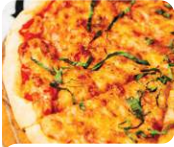
KIDS PIZZA 240 Mini margarita pizza