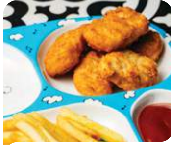
CHICKEN NUGGET 200 Deep fried chicken nugget served with french fries