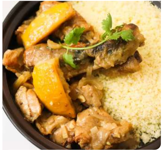
CHICKEN AND LEMON CONFIT TAJINE 500

Stew lamb, apricot, spices served with couscous semoule