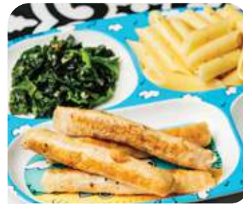
PENNE CHICKEN SAUSAGE AND SPINACH 220 Chicken herb sausage served with penne and sauteed spinach