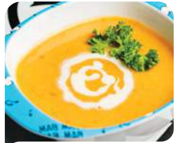
VEGETABLE SOUP 270 Creamy tomato and vegetable soup