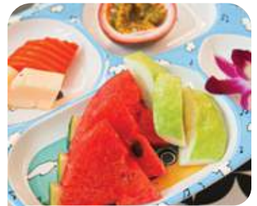
FRUIT PLATTER 150 Fresh Phuket mixed fruits