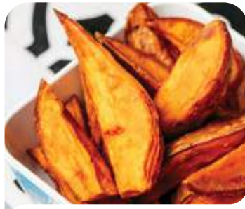
SWEET POTATO FRIED 120 Sweet potato wedges