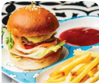
KIDS CHEESE BURGER 280 Australian beef pattie, lettuce and tomato, cheddar cheese, mayonaise, and sesame bun served with french fries