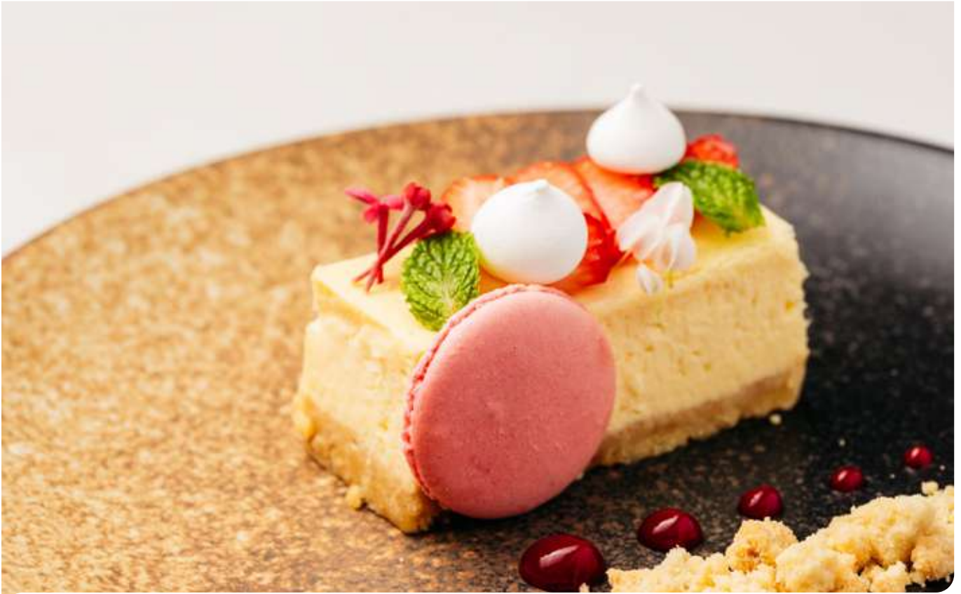
YOGHURT CHEESE CAKE 350 Organic yogurt cheesecake, fresh strawberry, and red berries coulis