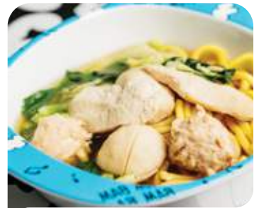
CHICKEN NOODLE SOUP 160 Egg noodle soup with chicken and vegetables