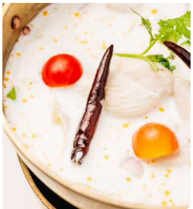
TOM KA KAI 200

Tomato, Italian basil, cream, and fresh herbs crostini