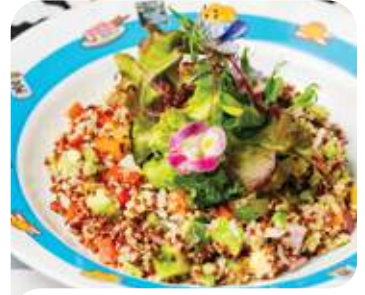
QUINOA SALAD 200 Quinoa, tomato, capsicum, red onion, and green salad