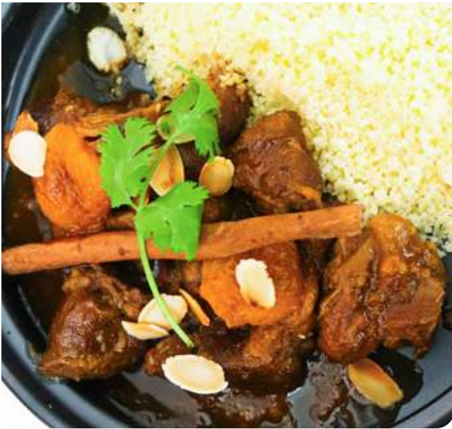
LAMB AND APRICOT TAJINE 800

Stew lamb, apricot, spices served with couscous semoule