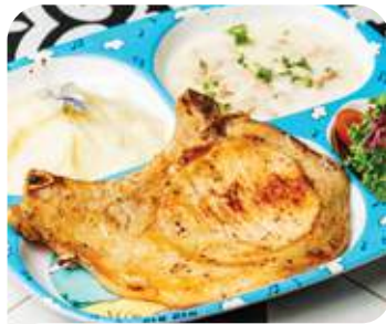
PORK CHOP WITH MUSHROOM CREAM SAUCE 320 Grilled pork chop, mashed potato, and mushroom cream sauce