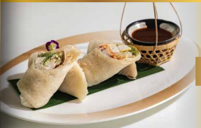
Por Pia Sod Phuket ปอเปี๊ยะสดภูเก็ต 320 Thai Style Red Pork Fresh Spring Roll with Palm Sugar, Tamarind & Five Spice 普吉春卷: 泰式红肉春卷搭配棕榈糖、罗望子和五香辛料