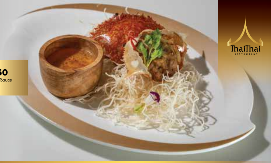
Poo Cha ปูจ๋า 450 Phuket Swimming Crab Bound with Pork, Shrimp, Soy, Garlic & Fish Sauce 普吉: 普吉岛游蟹搭配猪肉、虾、酱油、大蒜和鱼露