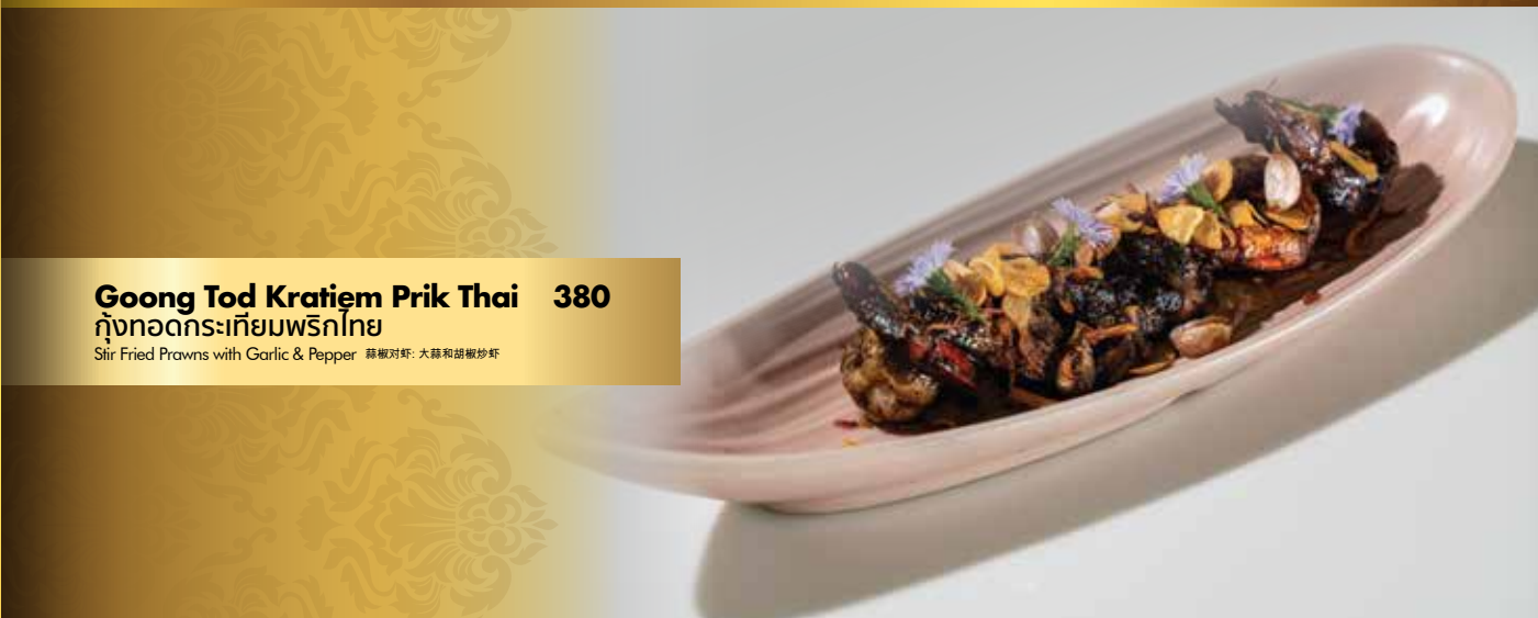
Goong Tod Kratiem Prik Thai 380 กุ้งทอดกระเทียมพริกไทย Stir Fried Prawns with Garlic & Pepper 蒜椒炒虾: 大蒜和甜椒炒虾