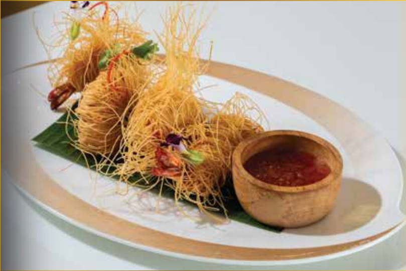
Goong Sarong กุ้งสอดรัง 450 Deep-Fried Prawns Wrapped in Egg Noodles 虾肉炒笼: 炸虾肉与蛋面 (含有虾肉与蟹肉)