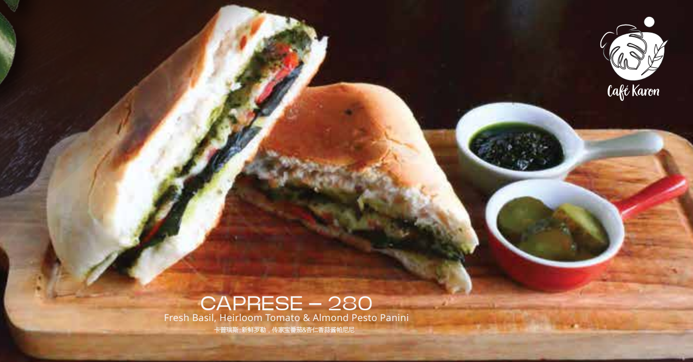
CAPRESE – 280 Fresh Basil, Heirloom Tomato & Almond Pesto Panini 卡普瑞斯：新鲜罗勒，传家宝番茄&杏仁香蒜酱帕尼尼