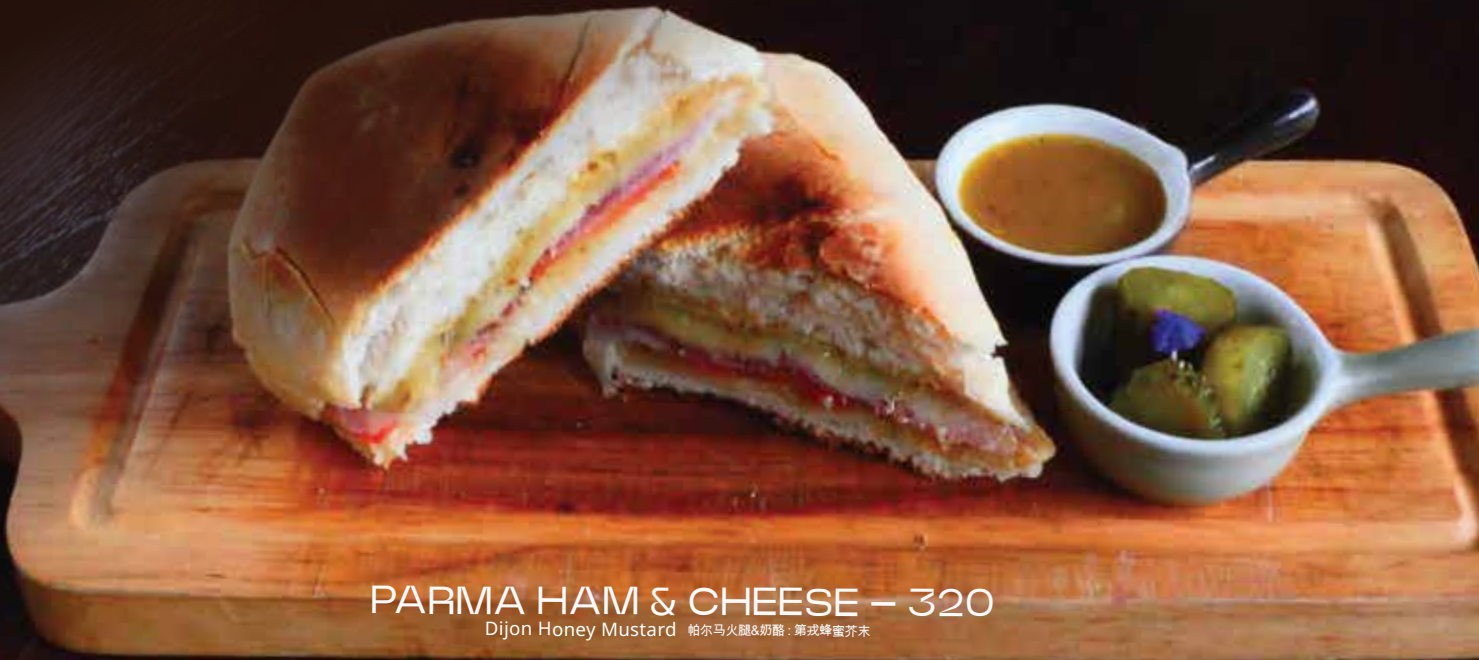
PARMA HAM & CHEESE – 320 Dijon Honey Mustard 帕尔马火腿&奶酪：第戎蜂蜜芥末