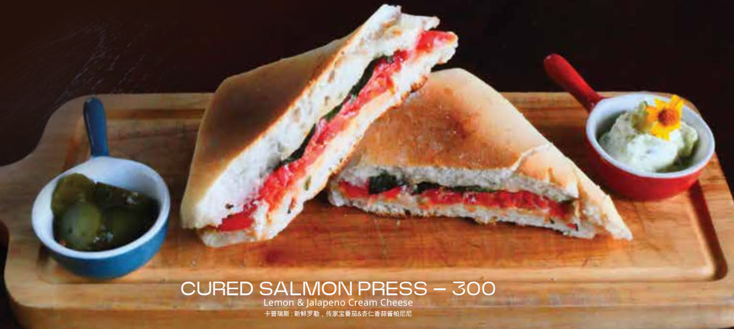
CURED SALMON PRESS – 300 Lemon & Jalapeno Cream Cheese 卡普瑞斯：新鲜罗勒，传家宝番茄&杏仁香蒜酱帕尼尼