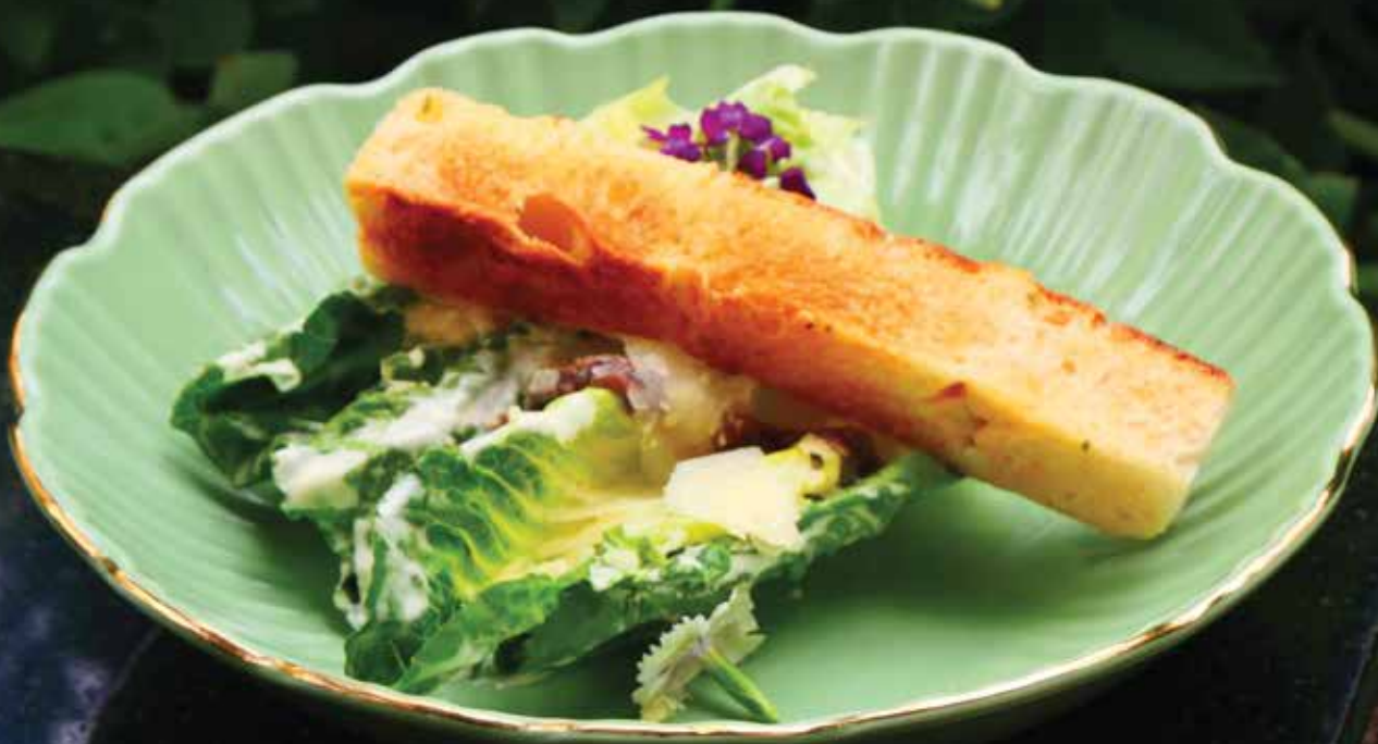
CAESAR SALAD – 300 Local Romain Lettuce, Aged Parmesan, Sour Dough Croutons & Anchovies 傳統凱撒沙拉: 當地生菜、陳年帕爾馬干酪、酸面团面包丁、鳳尾