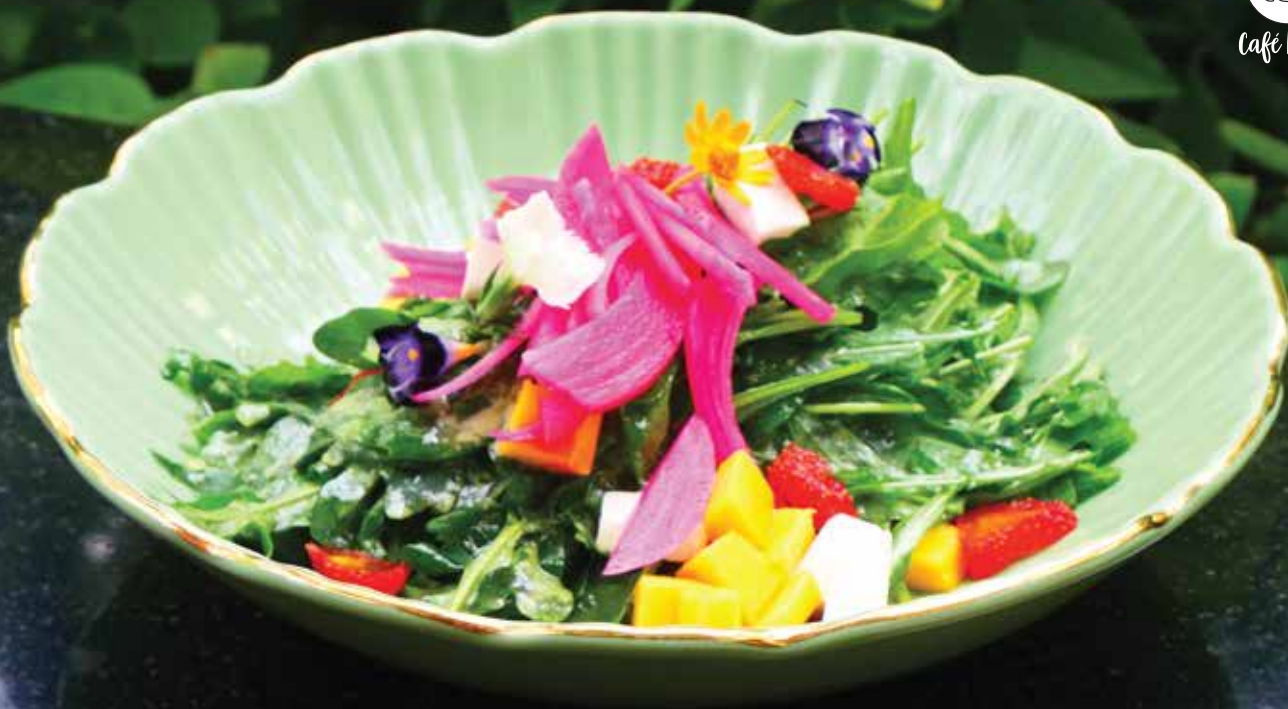
BABY ARUGULASALAD – 300 Sun Dried Strawberries, Mango, Pickled Onion, Feta Cheese & Lemon Vinaigrette 嬰兒芝麻菜沙拉: 曬乾的草莓、芒果、醃洋蔥、羊乳酪和檸檬油醋汁