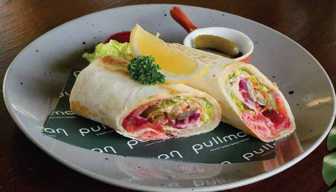
CURED SALMON, CUCUMBER & KIMCHI – 320 Baby lettuce, pickled onion, Siracha mayo 腌制三文鱼黄瓜泡菜卷 嫩生菜、腌洋葱与是拉差辣椒蛋黄酱