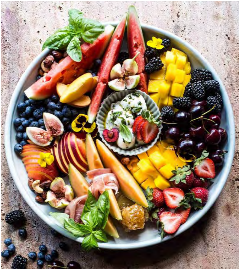
The image shown is for illustrative purposes only and is not a representation of the product.