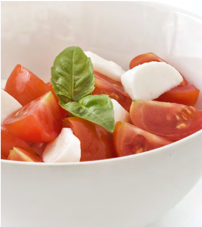
The image shown is for illustrative purposes only and is not a representation of the product.