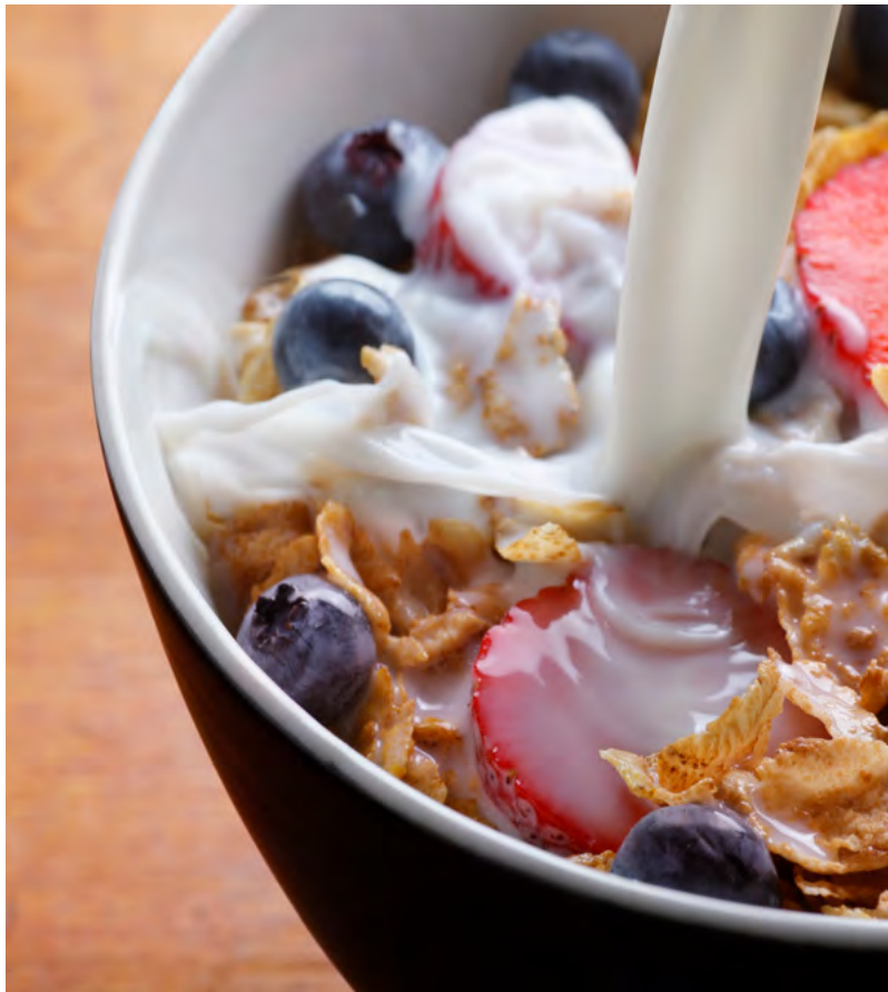
The image shown is for illustrative purposes only and is not a representation of the product.