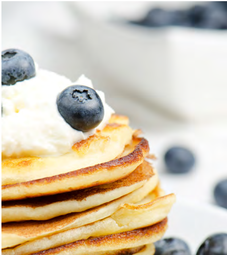
The image shown is for illustrative purposes only and is not a representation of the product.