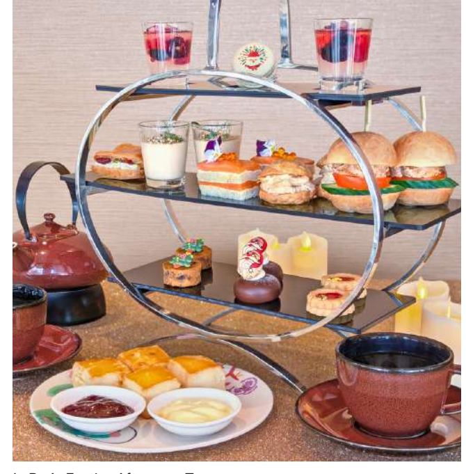
LeBar's Festive Afternoon Tea

Getting presents for your loved ones? Have a gift exchange? Give the Gift of Choice this Christmas. Our Holiday Vouchers and Gifts let your loved ones pick their ideal presents! Shop online via this link.