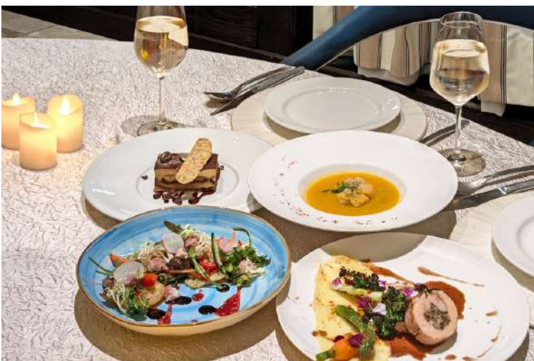
From top: Festive delights from Kwee Zeen and Club Matera at The Cliff