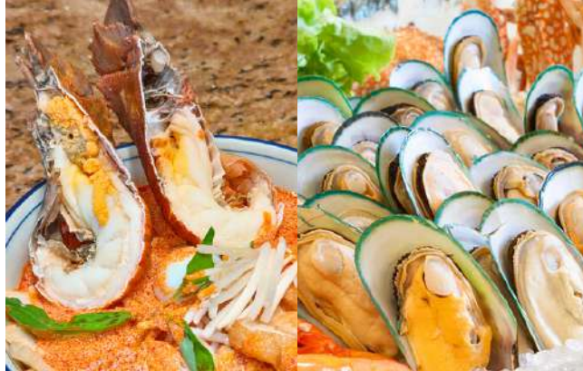
Slipper Lobster Laksa and Mussels from Kwee Zeen

Please click here to book our 60 Years of Celebration experience.