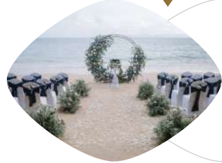
Wing A Lawn