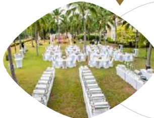
Wing A Lawn