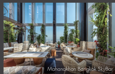
Mahanakhon Bangkok SkyBar