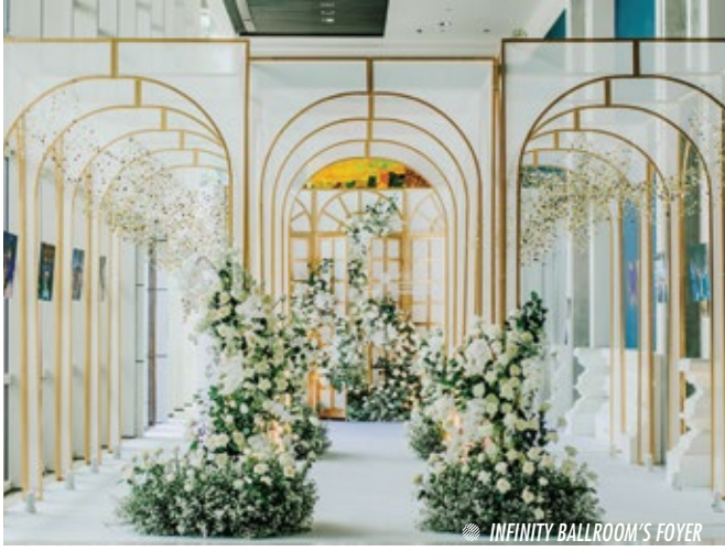
INFINITY BALLROOM'S FOYER