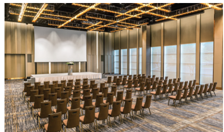
ETERNITY, 470 sq.m of daylight ballroom with pre-function space and open kitchen where can organize a meeting.