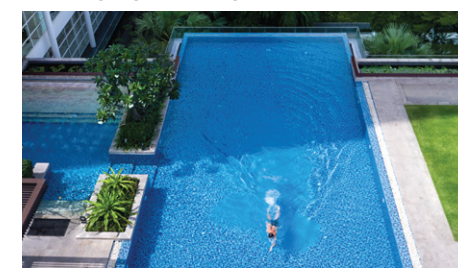
SWIMMING POOL, 27-meter outdoor swimming pool with lacuzzi, located on the 4th floor.