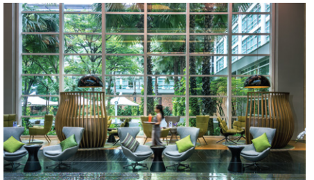
THE JUNCTION AT PULLMAN, a stylist lobby by Pullman where barista meets pop-up bar. A place to meet with rotative food & beverage offers for sit-in and take away.