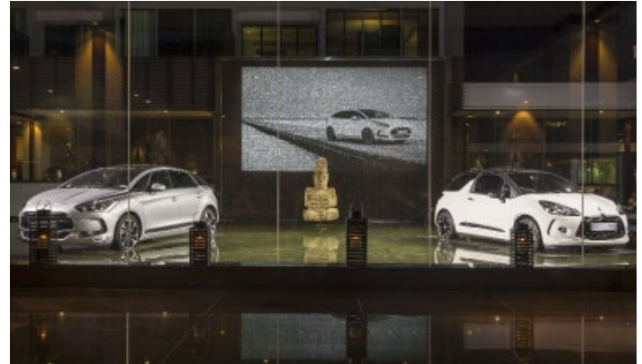
Dramatic water-filled lobby and unique waterfall