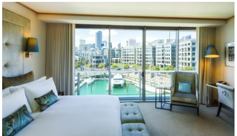
Luxury Marina View Room