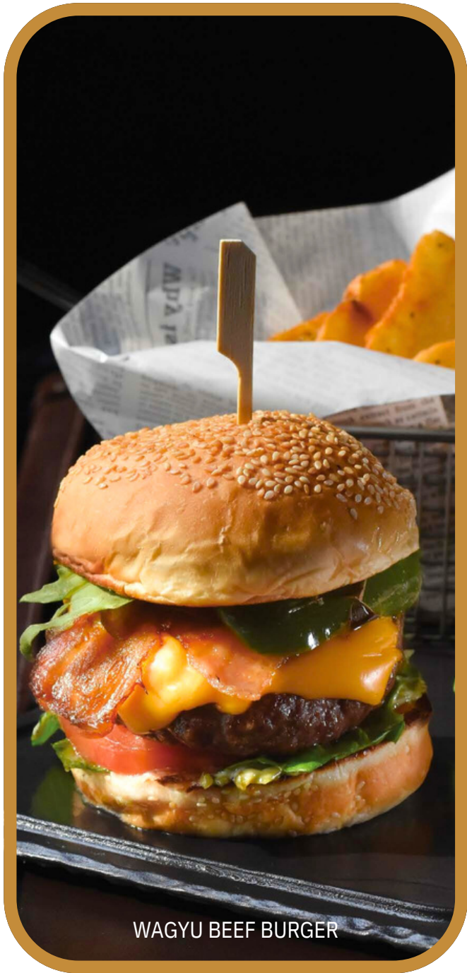
WAGYU BEEF BURGER