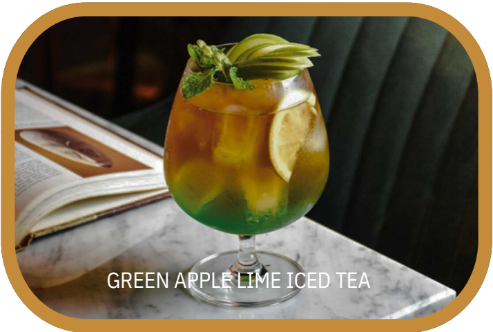
GREEN APPLE LIME ICED TEA