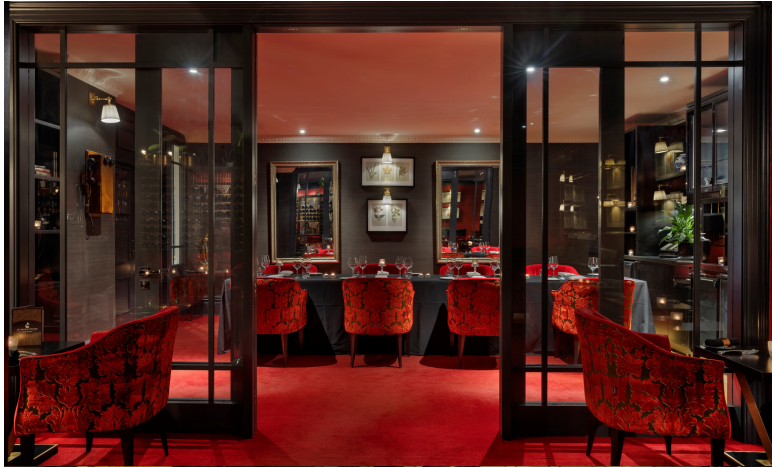
Le Salon Rouge