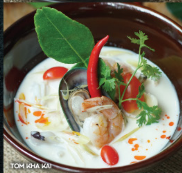
TOM KHA KAI