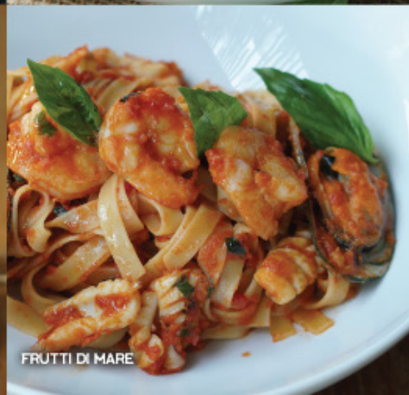
FRUTTI DI MARE