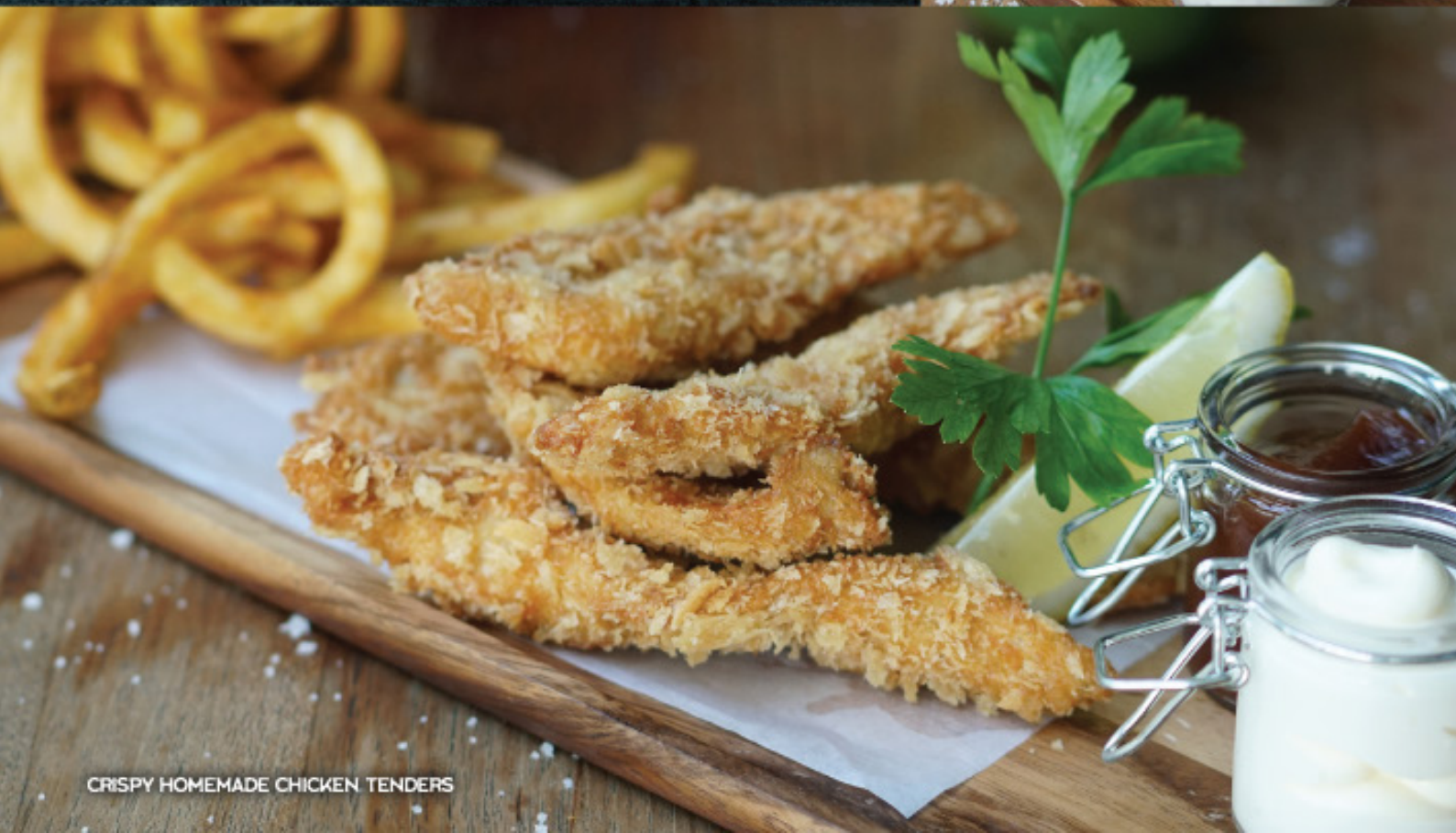
CRISPY HOMEMADE CHICKEN TENDERS