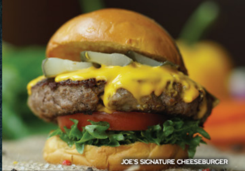
JOE'S SIGNATURE CHEESEBURGER

Sesame seeds brioche bun, seared Cajun dusted chicken breast, celery, crisp lettuce, beef tomato, pancetta and Mexican chipotle mayo (contains pork)