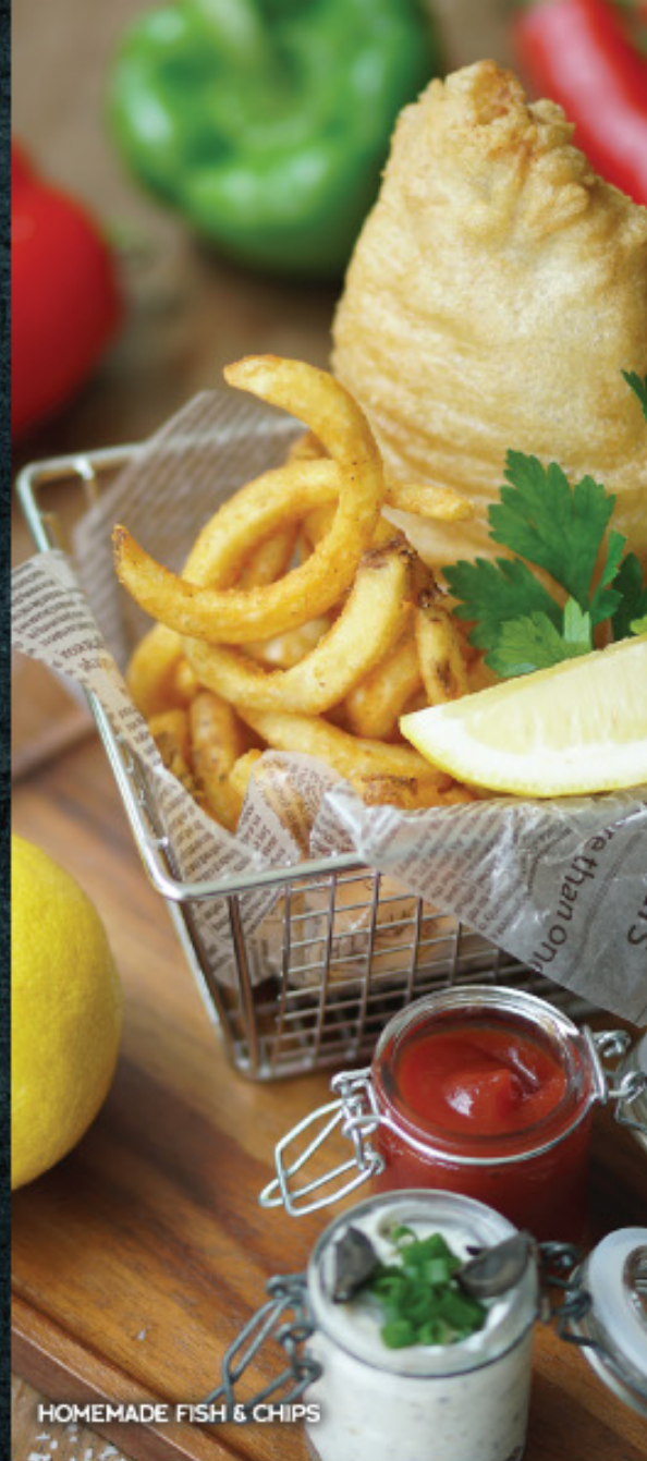
HOMEMADE FISH & CHIPS

*All items are quoted in Thai Baht and are exclusive of VAT and 10% service charge