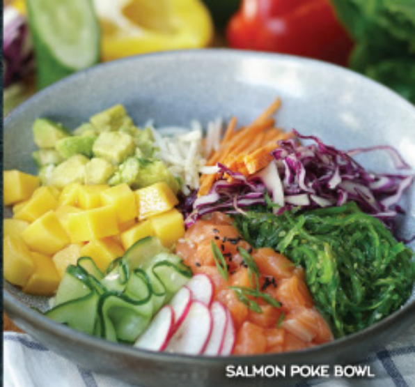
SALMON POKE BOWL

Norwegian salmon trout tartar seasoned with honey & sesame, accompanied with tender bulgur, locally grown mango, Japanese cucumber, Australian Imported Hass avocado, edamame, wakame, crispy tempura bits, carrot, bean sprouts, red radish & red cabbage