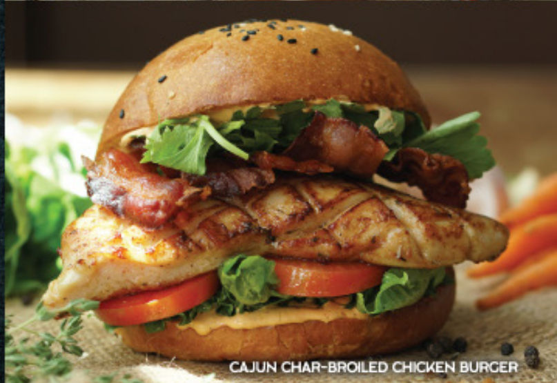
CAJUN CHAR-BROILED CHICKEN BURGER