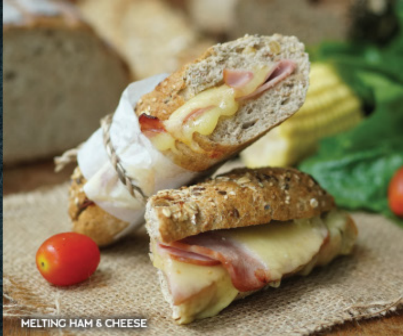
MELTING HAM & CHEESE

Some layers of tastes! Grilled chicken breast, fried egg, smoked ham, fresh greens medley, grilled smoked bacon, tomato, cucumber and garlic mustard mayo in a crispy multi cereal triangle bread (contains pork)