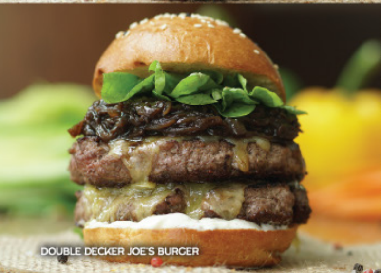
DOUBLE DECKER JOE'S BURGER

Sesame seeds brioche bun, certified Charolais beef, cheddar cheese, onion balsamic jam, arugula, truffle mayo