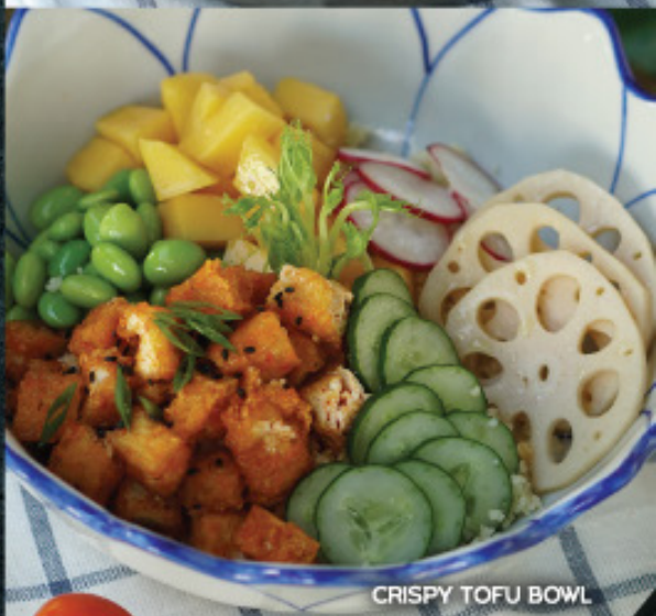
CRISPY TOFU BOWL

Delicate tofu marinated with chili paste & soy sauce accompanied with tender bulgur, locally grown mango, Japanese cucumber, Australian imported Hass avocado, fresh lotus root, edamame and red radish