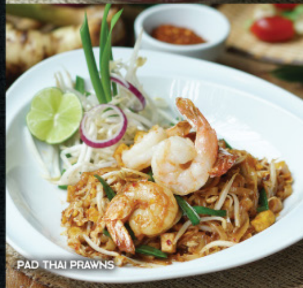
PAD THAI PRAWNS