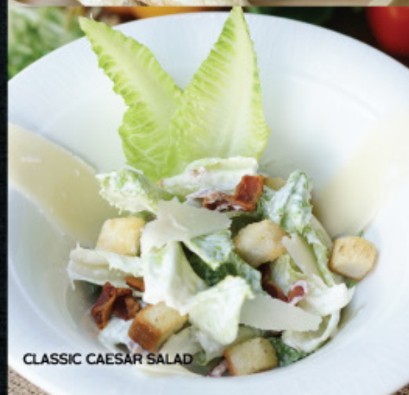
CLASSIC CAESAR SALAD